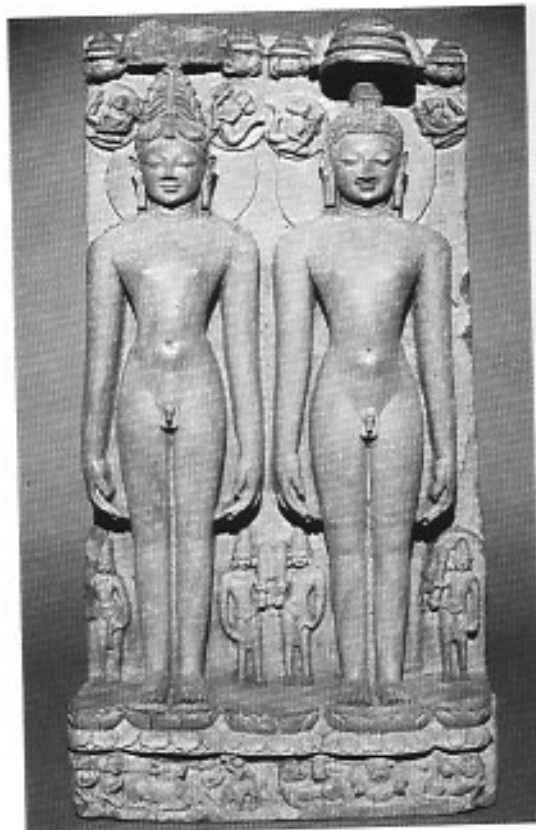
Mahavira with one of his disciples. Representations of the early Jains often depicted them in the nude because of their ascetic way of life.

charlatans who enriched themselves by hoodwinking others, and that human beings came from dust and returned to dust like any other animal in the natural world. The Charvakas' beliefs clearly reflected the increasingly materialistic character of Indian society and economy. Others, such as the Jains, the Buddhists, and the Hindus, turned to intense spirituality as an alternative to the mechanical rituals of the brahmins.