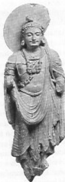
Carving of a bodhisattva from the second or third century C.E. This carving perhaps represents Avalokitesvara, also known as the Lord of Compassion. Almost as perfect as the Buddha, Avalokitesvara had a reputation for protecting merchants and sailors, helping women conceive, and turning enemies into kindhearted friends.

The work is a self-contained episode of the Mahabharata . It presents a dialogue between Arjuna, a kshatriya warrior about to enter battle, and his charioteer Krishna, who was in fact a human incarnation of the god Vishnu. The immediate problem addressed in the work was Arjuna’s reluctance to fight: the enemy included many of his friends and relatives, and even though he recognized the justice of his cause, he shrank from the conflict. In an effort to persuade the warrior to fight, Krishna presented Arjuna with several lines of argument. In the first place, he said, Arjuna must not worry about harming his friends and relatives, because the soul does not die with the human body. Arjuna’s weapons did not have the power to touch the soul, so he could never harm or kill another person in any meaningful way.