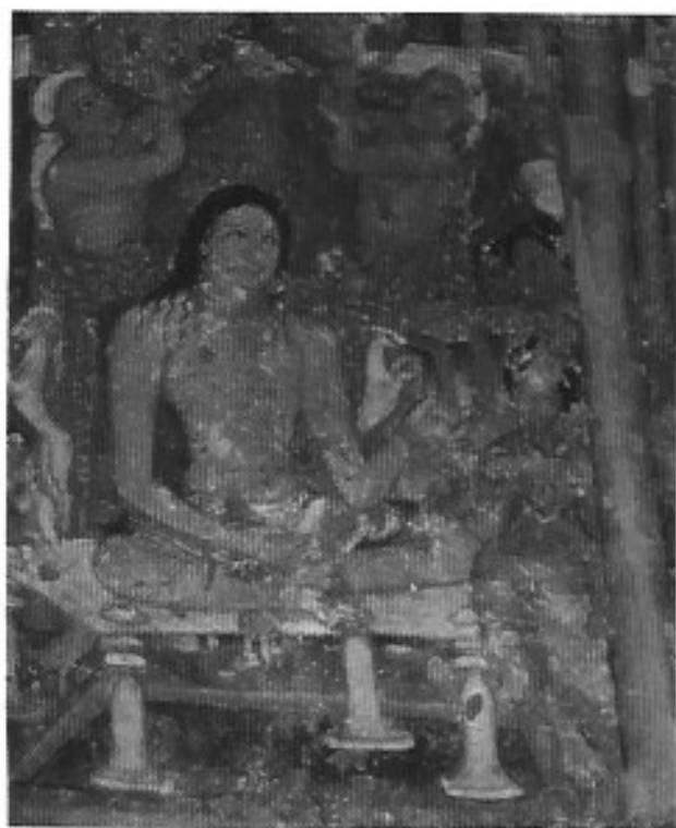
A painting produced in the late fifth century C.E. depicts the Buddha seated under a pavilion as servants attend to his needs and anoint him with holy water.

previously witnessed, Gautama considered the monk a noble character and determined to take up an ascetic, wandering life for himself in the hope that it would help him to understand the phenomenon of suffering. Though not a strictly historical account, this story conveys well the Buddhist concern with suffering.