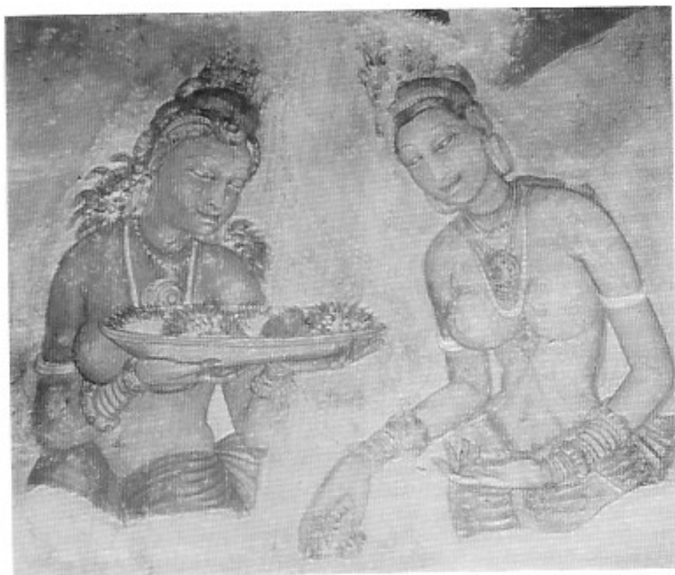
Jewel-bedecked flying goddesses drop flowers on the earth from their perch in the heavens. Their gems and personal adornments reflect the tastes of upper-class women during the Gupta dynasty. This painting on a rock wall, produced about the sixth century C.E., survives in modern Sri Lanka.

Jati regularly organized courts, through which they disciplined guild members, resolved differences, and regulated community affairs. Individuals who did not abide by group rules were liable to expulsion from the community. These outcasts then had to make their way through life—often by working as butchers, leather tanners, or undertakers or in other occupations deemed low and unclean—without the networks of support provided by jati . Thus Indian guilds and jati performed services that central governments provided in other lands. The tendency for individuals and their families to associate closely with others of the same occupation remained a prominent feature of Indian society well into modern times.