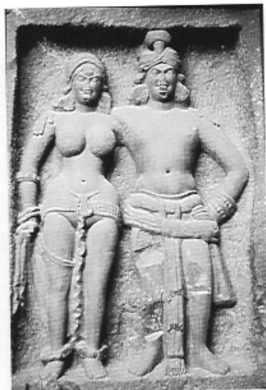
Buddhist art often depicted individuals as models of proper social relationships. Here a sculpture from a Buddhist temple at Karli, produced about the first century C.E., represents an ideal Buddhist married couple.

In effect, the guilds functioned as subcastes, known as jati , based on occupation. In fact, jati assumed much of the responsibility for maintaining social order in India.