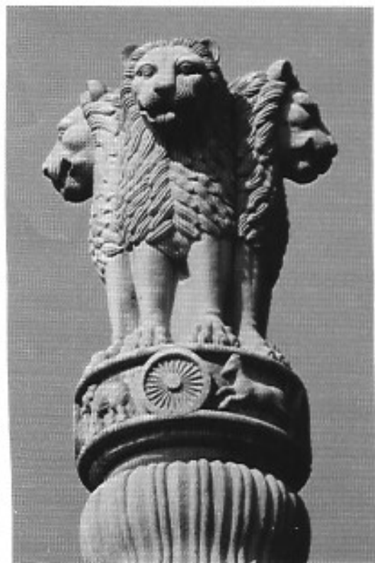
As a symbol of his rule, Ashoka had this sculpture of four lions mounted atop a column about 20 meters (66 feet) tall. The lion capital is the official symbol of the modern Republic of India.

Ashoka began his reign (268–232 B.C.E.) as a conqueror. When he came to power, the only major region that remained independent of the Mauryan empire was the kingdom of Kalinga (modern Orissa) in the east-central part of the subcontinent. In fact, Kalinga was not only independent of Mauryan rule but also actively hostile to its spread. The kingdom's resistance created difficulties for Ashoka because Kalinga controlled the principal trade routes, both by land and by sea, between the Ganges plain and southern India. Thus Ashoka's first major undertaking as emperor was to conquer Kalinga and bring it under Mauryan control, which he did in a bloody campaign in 260 B.C.E. By Ashoka's estimate, 100,000 Kalingans died in the fighting, 150,000 were driven from their homes, and untold numbers of others perished in the ruined land.