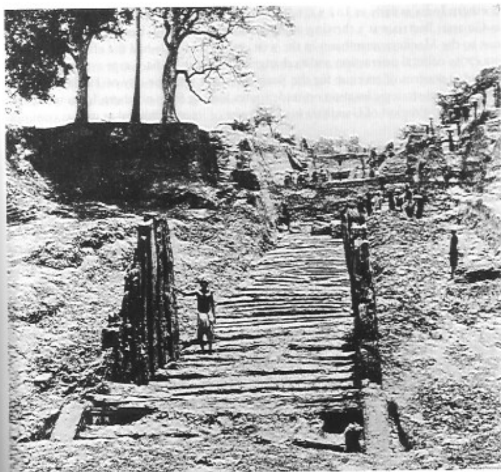
Archaeological excavations have unearthed parts of the defensive palisade, constructed of timbers almost 5 meters (16 feet) tall, that surrounded Pataliputra during Mauryan times.

their pay. Eventually, those administrative costs outstripped the revenues that flowed into the central treasury. The later Mauryan emperors often resorted to the tactic of debasing their currency—reducing the amount of precious metal in a coin without reducing its nominal value. Because of their financial difficulties, they were unable to hold the realm together. They maintained control of the Ganges valley for some fifty years after Ashoka's death, but eventually they lost their grip even on this heartland of the Mauryan empire. By about 185 B.C.E. the Mauryan empire had disappeared.