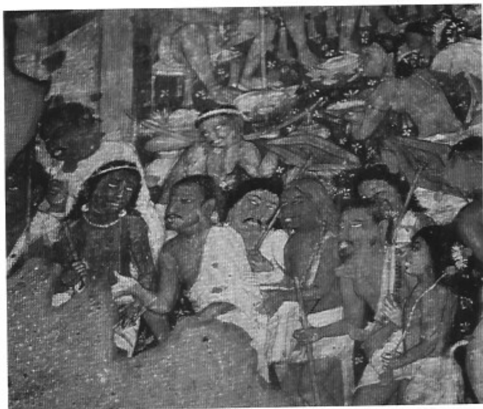
A painting produced in the sixth century C.E. in the Ajanta caves of central India depicts individuals of different castes, jati , and ethnic groups in a crowd scene.

Economic development and social change in classical India had profound implications for the established cultural as well as the social order. The beliefs, values, and rituals that were meaningful in early Aryan society seemed increasingly irrelevant during the centuries after 600 B.C.E. Along with emerging towns, growing trade, increasing wealth, and a developing social structure, classical India also saw the appearance of new religions that addressed the needs of the changing times.