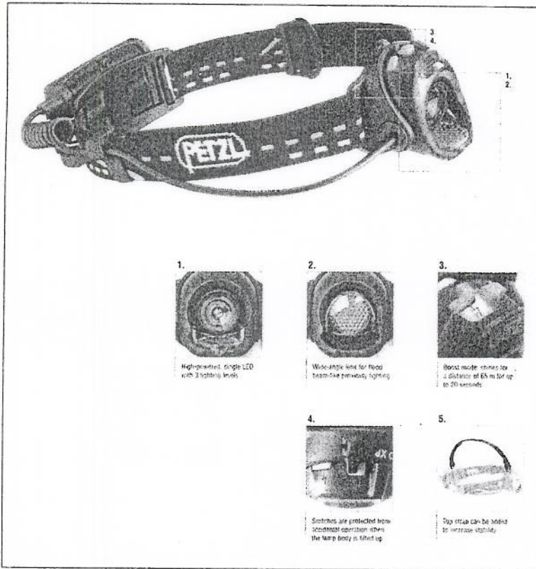
Figure 20.2 Graphic with Enlarged Detailed Graphics

In this description of a headlamp, the introductory graphic includes five graphics showing different portions or views of the headlamp or additional components. Notice the use of the numbered boxes to help readers link the individual boxes to the main photograph of the headlamp.