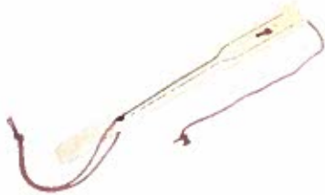
Mouth harp mukkuriムックリ

https://www.youtube.com/watch?v=AiXAFtmsydl Mukkuri/Ainu