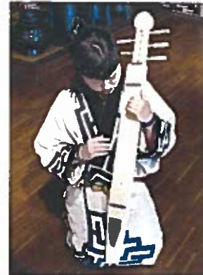
Tonkori zither Tonkoriトンコリ

https://www.youtube.com/watch?v=AiXAFtmsydl Mukkuri/Ainu