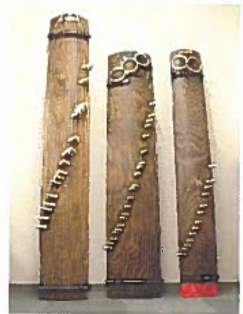
17 /20/13 stringed koto (十七・二十・十三絃)