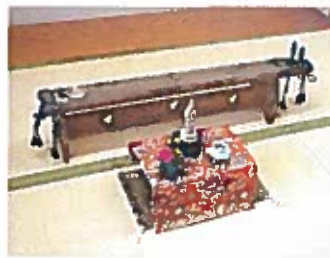
Yagumo goto (八雲箏) or Nigen kin (二絃琴)