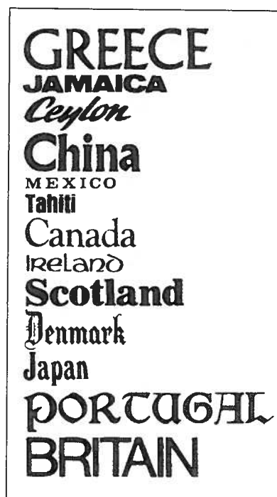
Figure 14.9 Type as Cultural Cliché.