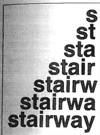
Figure 14.8 Stairway.