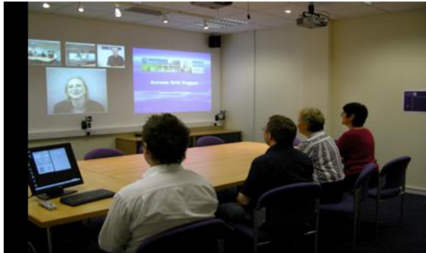
Figure 4: An Access Grid session [36]

Access Grid is a video teleconferencing application that runs over networks such as the Internet and employs several cameras recording the same interaction and multiple video feeds from several different external sites coming in at once. Users increasingly want to work by comparison and contrast between several video feeds. CAQDAS tools enable such synchronization. This could open up citizen research where people want to edit and interpret material like YouTube clips. [37]