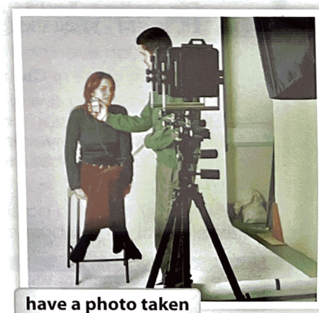
have a photo taken

C: Really? Why did you have it taken? . . .