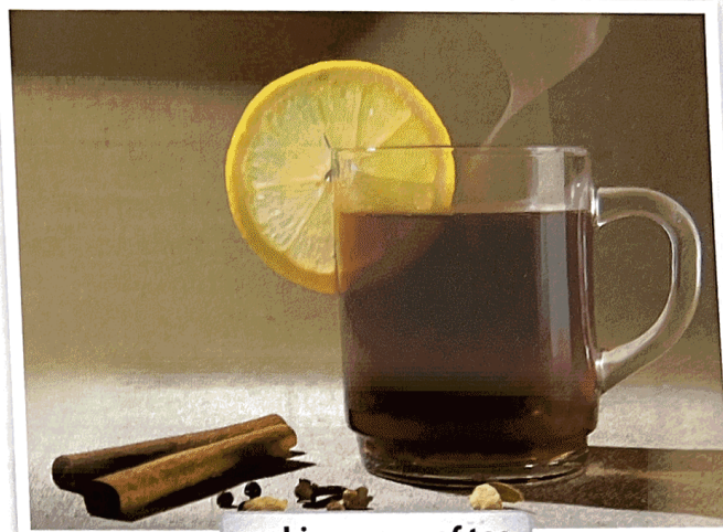
making a cup of tea

Finally, the email is delivered to the person's in-box.