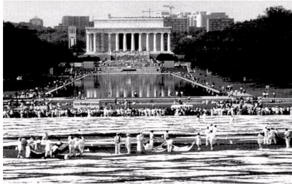
Figure 20. Volunteers unfolding the AIDS Quilt, Washington, D.C., 1992.

occasion for remembering as much for facing death and seeing past it. The late Vito Russo used to say at rallies, "I am here today because I don't want a quilt with my name on it to be in front of the White House next year"; there are now several panels that bear his name. Thus, for many people with AIDS, the image of the quilt is one of relentless death. 24