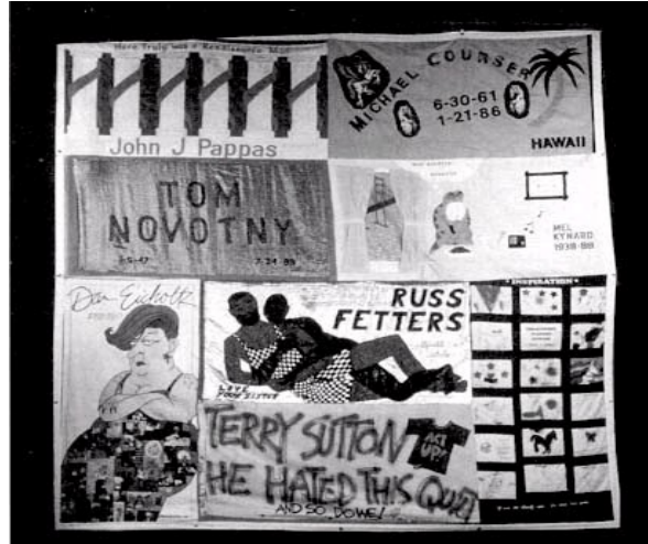
Figure 19. Twelve-by-twelve-foot section of the AIDS Memorial Quilt.