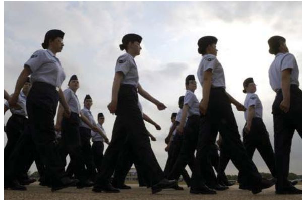
Figure 5.9 In basic training, members of the Air Force are taught to walk, move, and look like each other.

In other situations, the degradation ceremony can be more extreme. New prisoners lose freedom, rights (including the right to privacy), and personal belongings. When entering the army, soldiers have their hair cut short. Their old clothes are removed, and they wear matching uniforms. These individuals must give up any markers of their former identity in order to be resocialized into an identity as a “soldier.”