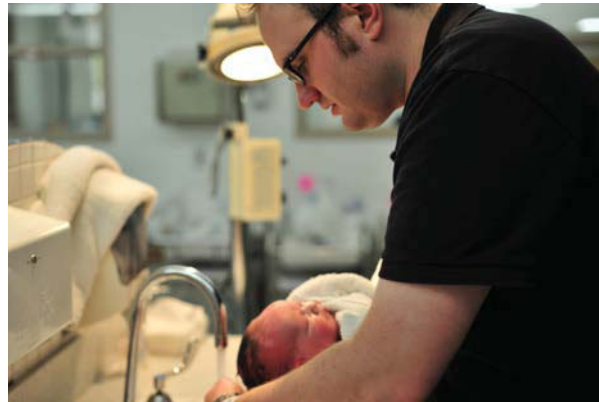
Figure 5.5 The socialized roles of dads (and moms) vary by society.

In Sweden, for instance, stay-at-home fathers are an accepted part of the social landscape. A government policy provides subsidized time off work—480 days for families with newborns—with the option of the paid leave being shared between mothers and fathers. As one stay-at-home dad says, being home to take care of his baby son “is a real fatherly thing to do. I think that’s very masculine” (Associated Press 2011). Close to 90 percent of Swedish fathers use their paternity leave (about 340,000 dads); on average they take seven weeks per birth (The Economist, 2014). How do U.S. policies—and our society’s expected gender roles—compare? How will Swedish children raised this way be socialized to parental gender norms? How might that be different from parental gender norms in the United States?