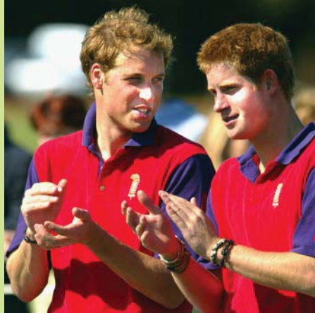
Figure 5.8 Age transition points require socialization into new roles that can vary widely between societies. Young adults in America are encouraged to enter college or the workforce right away, students in England and India can take a year off like British Princes William and Harry did, while young men in Singapore and Switzerland must serve time in the military.

Have you ever heard of gap year? It's a common custom in British society. When teens finish their secondary schooling (aka high school in the United States), they often take a year “off” before entering college. Frequently, they might take a job, travel, or find other ways to experience another culture. Prince William, the Duke of Cambridge, spent his gap year practicing survival skills in Belize, teaching English in Chile, and working on a dairy farm in the United Kingdom (Prince of Wales 2012a). His brother, Prince Harry, advocated for AIDS orphans in Africa and worked as a jackeroo (a novice ranch hand) in Australia (Prince of Wales 2012b).