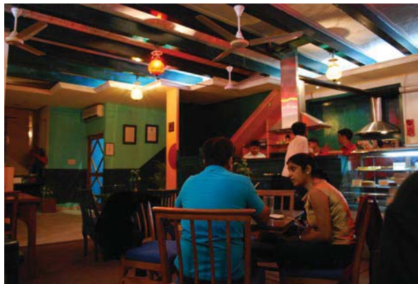
Figure 5.3 Socialization teaches us our society's expectations for dining out. The manners and customs of different cultures (When can you use your hands to eat? How should you compliment the cook? Who is the "head" of the table?) are learned through socialization.

Socialization is critical both to individuals and to the societies in which they live. It illustrates how completely intertwined human beings and their social worlds are. First, it is through teaching culture to new members that a society perpetuates itself. If new generations of a society don't learn its way of life, it ceases to exist. Whatever is distinctive about a culture must be transmitted to those who join it in order for a society to survive. For U.S. culture to continue, for example, children in the United States must learn about cultural values related to democracy: they have to learn the norms of voting, as well as how to use material objects such as voting machines. Of course, some would argue that it's just as important in U.S. culture for the younger generation to learn the etiquette of eating in a restaurant or the rituals of tailgate parties at football games. In fact, there are many ideas and objects that people in the United States teach children about in hopes of keeping the society's way of life going through another generation.