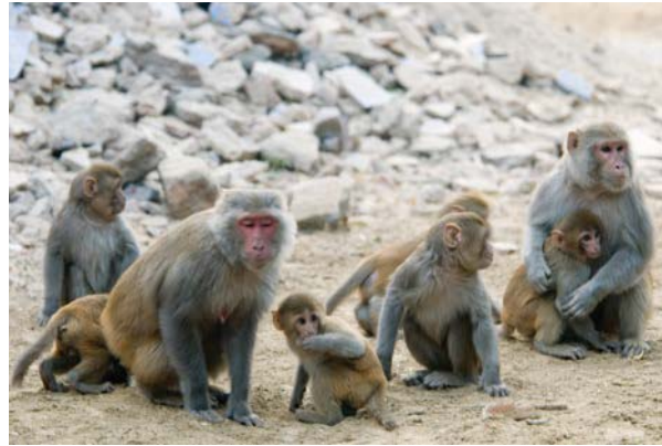
Figure 5.2 Baby rhesus monkeys, like humans, need to be raised with social contact for healthy development.

In the following sections, we will examine the importance of the complex process of socialization and how it takes place through interaction with many individuals, groups, and social institutions. We will explore how socialization is not only critical to children as they develop but how it is also a lifelong process through which we become prepared for new social environments and expectations in every stage of our lives. But first, we will turn to scholarship about self-development, the process of coming to recognize a sense of self, a “self” that is then able to be socialized.