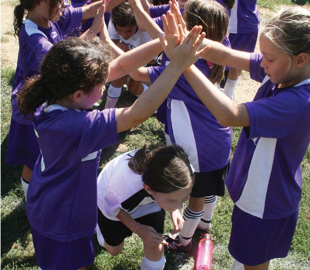
Figure 5.1 Socialization is the way we learn the norms and beliefs of our society. From our earliest family and play experiences, we are made aware of societal values and expectations.