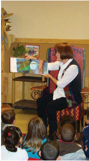
Figure 5.6 These kindergarteners aren't just learning to read and write; they are being socialized to norms like keeping their hands to themselves, standing in line, and reciting the Pledge of Allegiance.

School and classroom rituals, led by teachers serving as role models and leaders, regularly reinforce what society expects from children. Sociologists describe this aspect of schools as the hidden curriculum , the informal teaching done by schools.