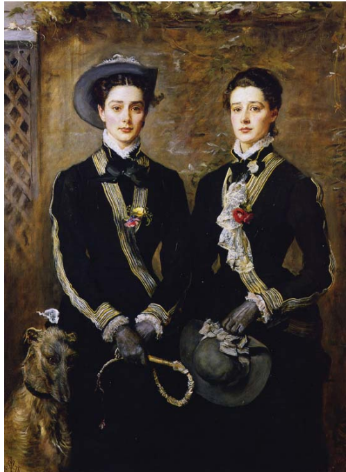
Figure 5.4 Identical twins may look alike, but their differences can give us clues to the effects of socialization.