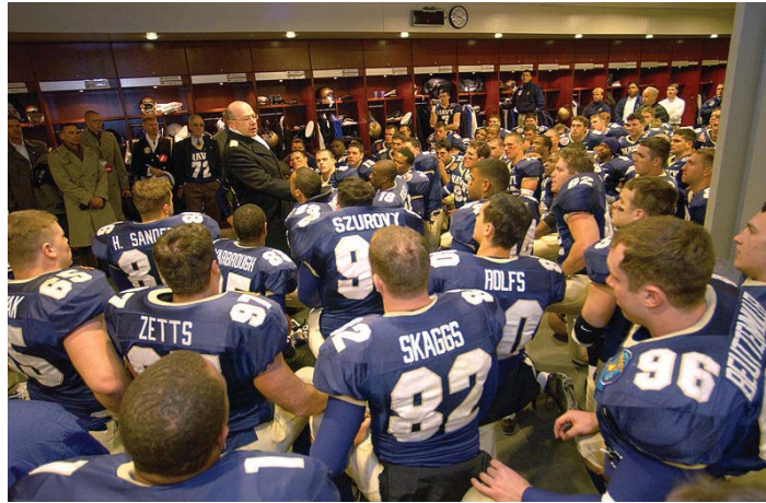
Figure 6.3 Athletes are often viewed as a reference group for young people.

A reference group is a group that people compare themselves to—it provides a standard of measurement. In U.S. society, peer groups are common reference groups. Kids and adults pay attention to what their peers wear, what music they like, what they do with their free time—and they compare themselves to what they see. Most people have more than one reference group, so a middle school boy might look not just at his classmates but also at his older brother’s friends and see a different set of norms. And he might observe the antics of his favorite athletes for yet another set of behaviors.