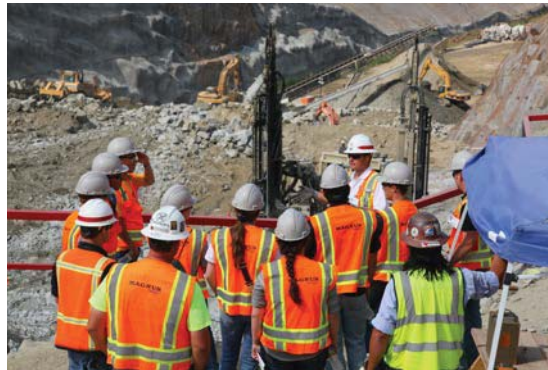
Figure 6.2 Engineering and construction students gather around a job site. How do your academic interests define your in- and out-groups?