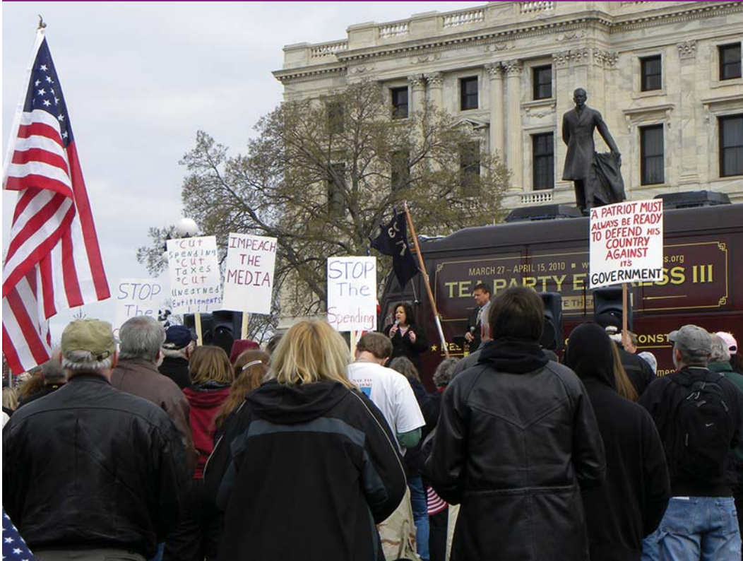
Figure 6.1 The national tour of the Tea Party Express visited Minnesota and held a rally outside the state capitol building.