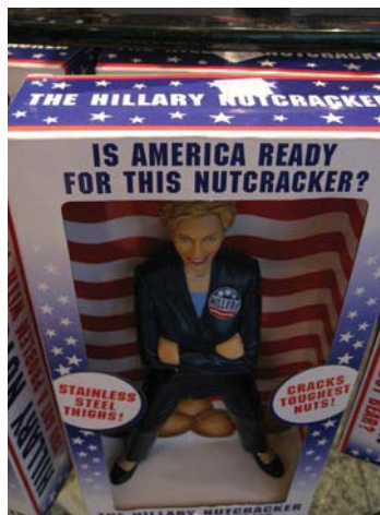
Figure 6.7 This gag gift demonstrates how female leaders may be viewed if they violate social norms.

So what does this mean for women who would be president, and for those who would vote for them? On the positive side, a recent study of eighteen- to twenty-five-year-old women that asked whether female candidates in the 2008 election made them believe a woman would be president during their lifetime found that the majority thought they would (Weeks 2011). And the more that young women demand female candidates, the more commonplace female contenders will become. Women as presidential candidates may no longer be a novelty with the focus of their campaign, no matter how obliquely, on their gender. Some, however, remain skeptical. As one political analyst said bluntly, "Women don't succeed in politics—or other professions—unless they act like men. The standard for running for national office remains distinctly male" (Weeks 2011).