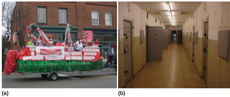
Figure 6.8 Girl Scout troops and correctional facilities are both formal organizations.

Sociologist Amitai Etzioni (1975) posited that formal organizations fall into three categories. Normative organizations , also called voluntary organizations , are based on shared interests. As the name suggests, joining them is voluntary and typically done because people find membership rewarding in an intangible way. The Audubon Society and a ski club are examples of normative organizations. Coercive organizations are groups that we must be coerced, or pushed, to join. These may include prison or a rehabilitation center. Symbolic interactionist Erving Goffman states that most coercive organizations are total institutions (1961). A total institution is one in which inmates or military soldiers live a controlled lifestyle and in which total resocialization takes place. The third type is utilitarian organizations , which, as the name suggests, are joined because of the need for a specific material reward. High school and the workplace fall into this category—one joined in pursuit of a diploma, the other in order to make money.