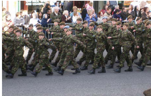
Figure 6.5 Cadets illustrate how strongly conformity can define groups.