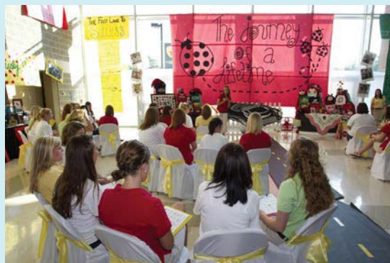
Figure 6.4 Which fraternity or sorority would you fit into, if any? Sorority recruitment day offers students an opportunity to learn about these different groups.

For a student entering college, the sociological study of groups takes on an immediate and practical meaning. After all, when we arrive someplace new, most of us glance around to see how