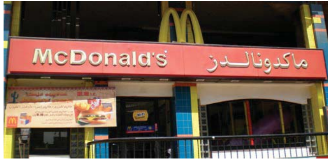
Figure 6.9 This McDonald's storefront in Egypt shows the McDonaldization of society.