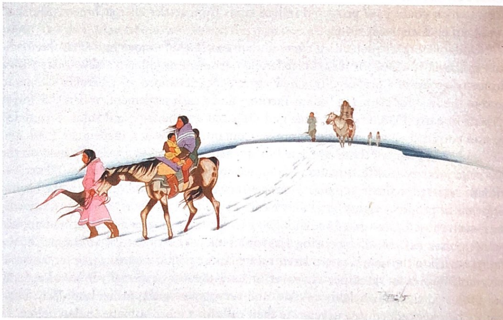
THE CHEROKEE REMOVAL The forced removal of Indians by the U.S. government created a demographic and historical catastrophe for Indian communities. Cherokee removal, represented here, began in the winter and imposed physical hardships as it alienated Indian people from their ancestral homelands.