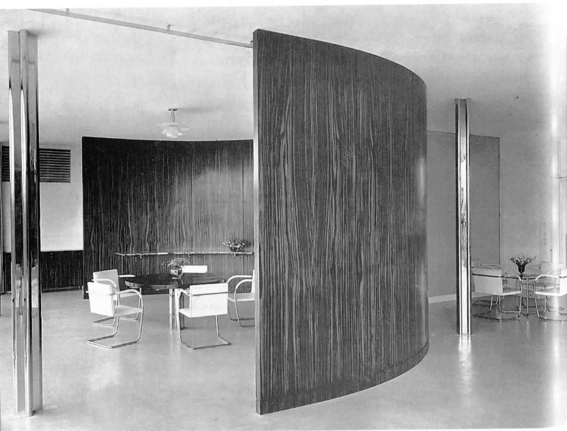
Architecture can render vivid to us who we might ideally be. Mies van der Rohe, dining area, Tugendhat House, Brno, 1930