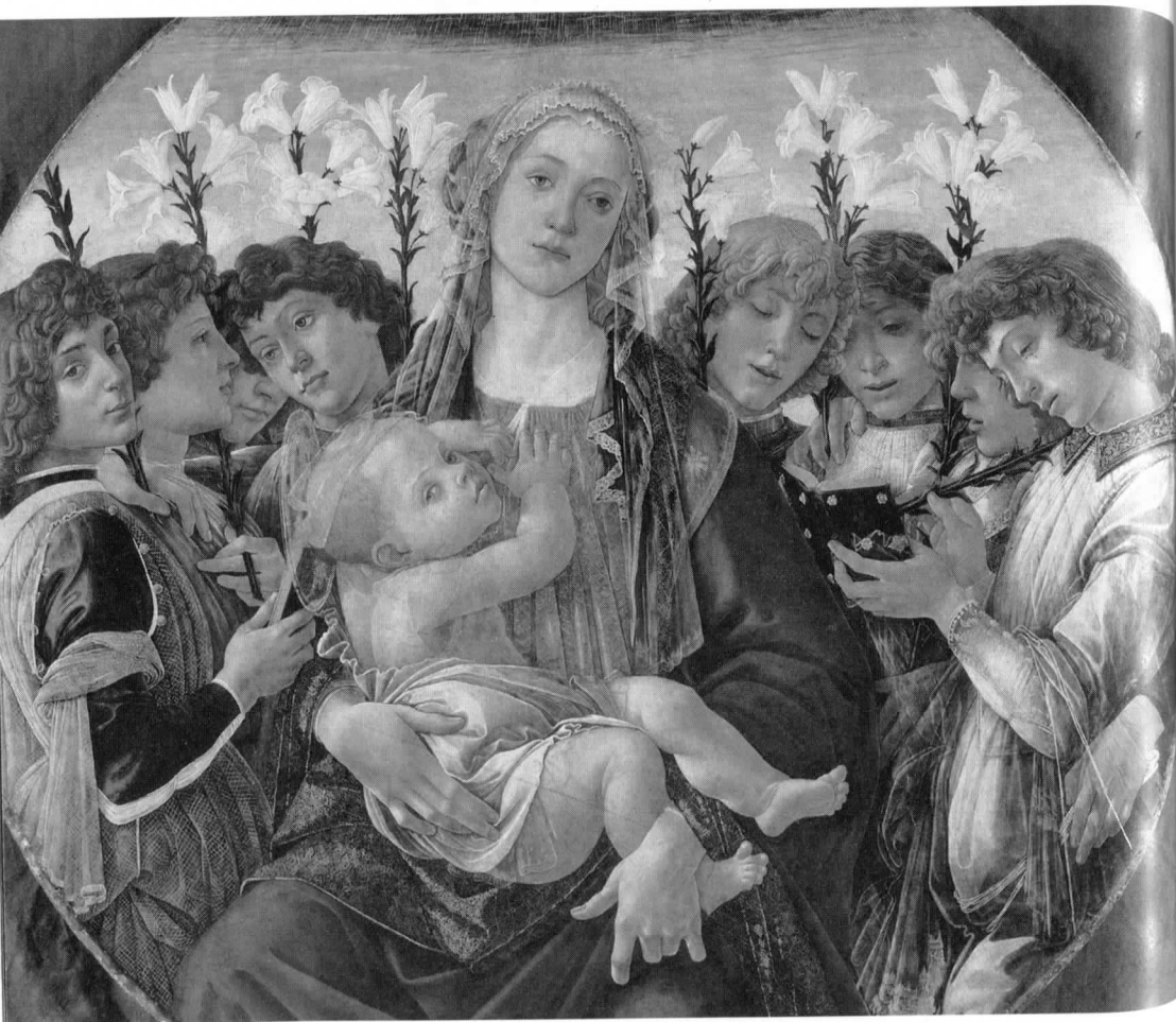
Sandro Botticelli, Madonna and Child with Eight Singing Angels , 1477

at the disjunction between the exceptionally tender atmosphere of the picture and the barbarous lessons he had learnt in the trenches.