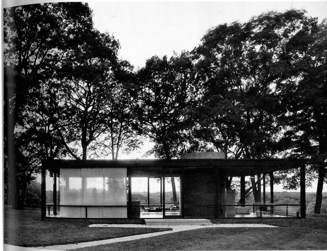
We would still often be in a bad mood: Philip Johnson, The Glass House, New Canaan, Connecticut, 1949

But, whatever the theoretical affinities between beauty and goodness, it is undeniable that, in practice, farmhouses and lodges, mansions and