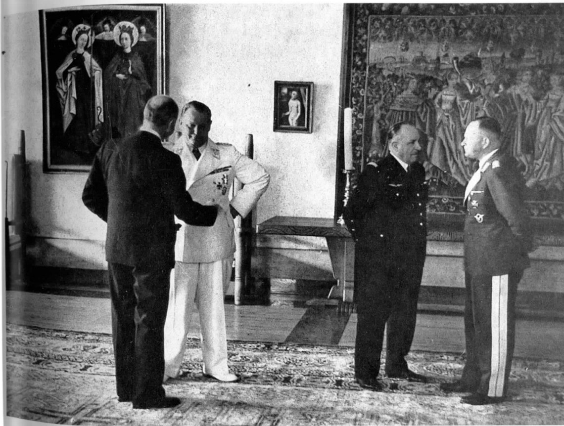
The moral ineffectiveness of a beautiful house: Hermann Göring (in white) at home with the French Ambassador and, to the right, Generals Vuillemin and Milch. In the background, Saints Margarethe and Dorothea , German (fifteenth century), and Lucretia (1532) by Lucas Cranach

However, after coming up against some of the sterner setbacks which