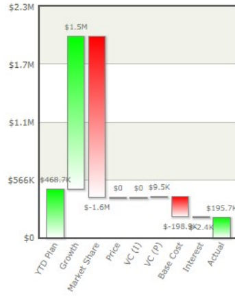
Pre-tax NI Walk: Plan YTD vs. Actual YTD