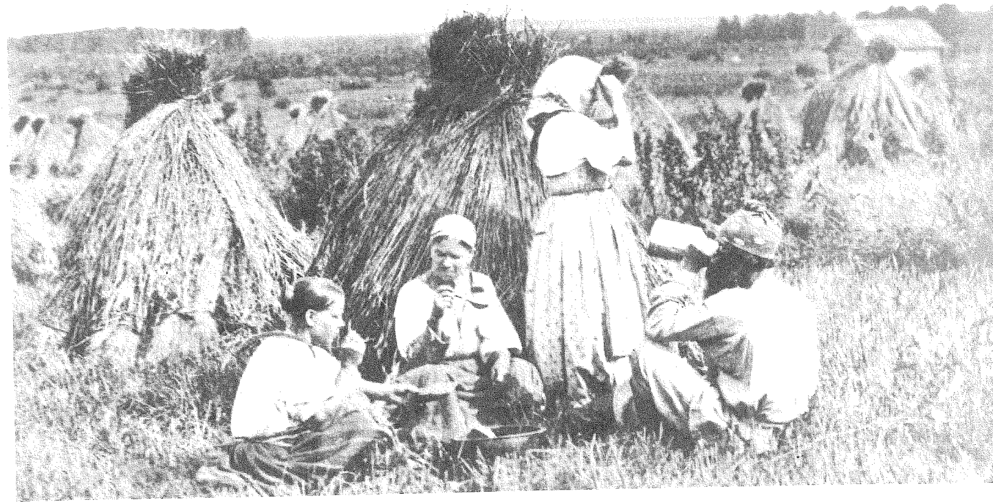
Russian agriculture depended on the contribution of women and girls, as this photograph attests.

logging, and carpentry were particularly important. Woodworkers, like this peasant barrel maker with his birch-bark shoes and homemade leggings, used an abundant raw material to fashion elaborate dolls and attractive wooden tableware as well as workaday items. Peasants also went to towns and cities for temporary work, and many settled there permanently as industrial workers in the 1890s.