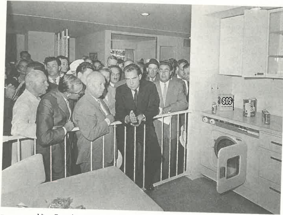
FIGURE 3 Vice President Richard Nixon and Soviet Premier Nikita Khrushchev spar verbally at the American Exhibition in Moscow in 1959. Here they engage in the “kitchen debate” as they fight the cold war over the commodity gap rather than the missile gap.

proclaimed that the “model” home, with a male breadwinner and a full-time female homemaker, adorned with a wide array of consumer goods, represented the essence of American freedom: