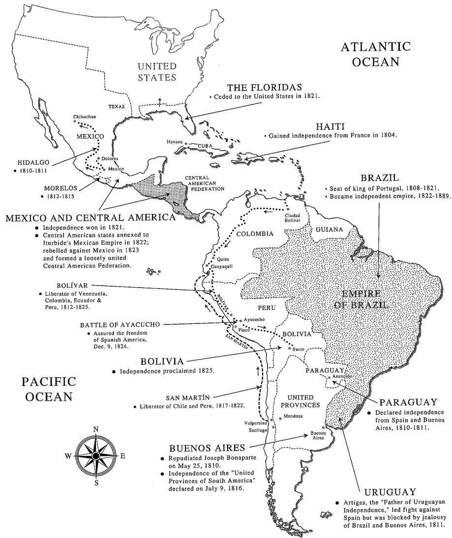
Map 3.2 Early Independence Movements

whose morale began to suffer under the constant campaigning and the effects of tropical diseases. The capture and execution of Morelos in 1815 did not end the popular insurrection, and Mexican guerrillas continued to harass the increasingly exhausted Spanish troops. Meanwhile, the efforts of