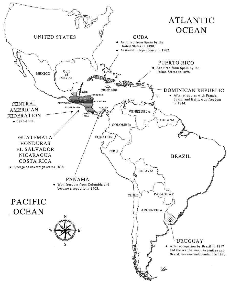
Map 3.3 Later Independence Movements

whose morale began to suffer under the constant campaigning and the effects of tropical diseases. The capture and execution of Morelos in 1815 did not end the popular insurrection, and Mexican guerrillas continued to harass the increasingly exhausted Spanish troops. Meanwhile, the efforts of