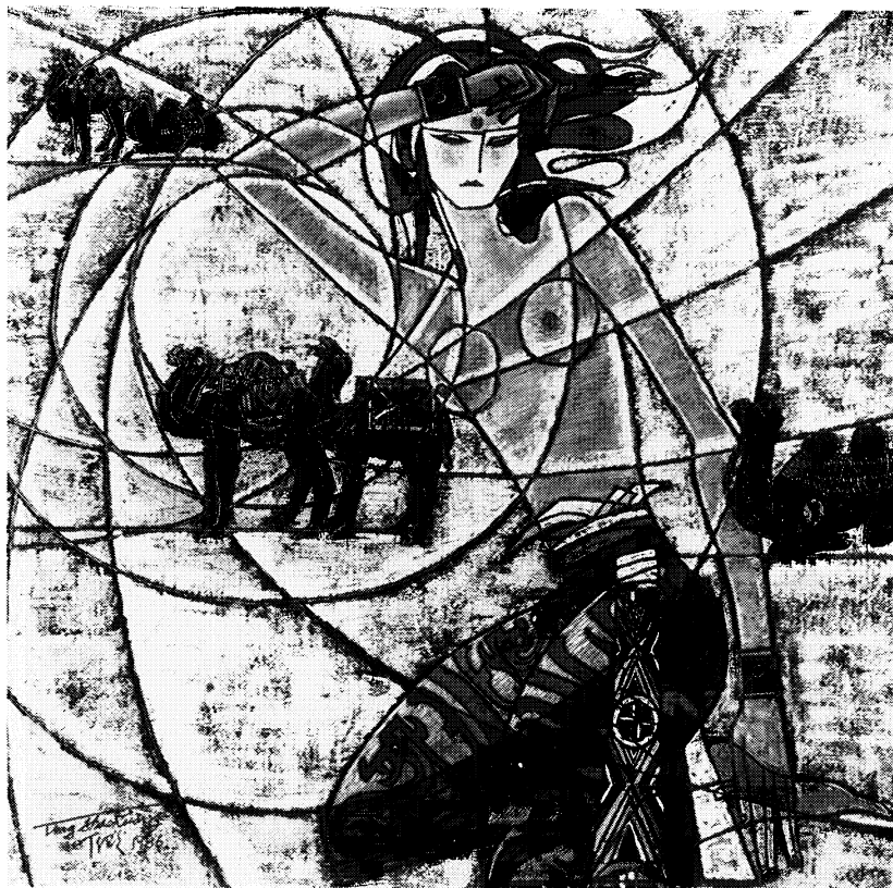
Figure 4. Ting Shao Kuang painting, Silk Road . In Ting Shao Kuang , 1990:7.