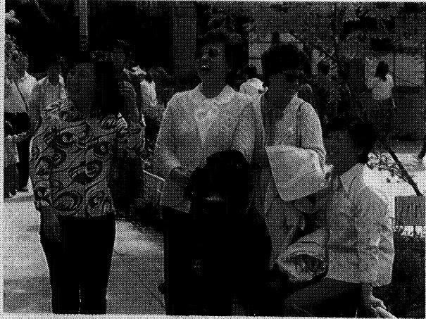
A spring outing.

Today’s Han nationality is a result of long-time national integration with other nationalities in the long course of historic development. In China’s history, there used to be many national exodus and integration, enabling the Han nationality to be the most populous and the most economically and culturally developed nationality in China. At present, Han people living in all the provinces, municipalities and autonomous regions account almost for 94 percent of the total population, also the most populous nation in the world.