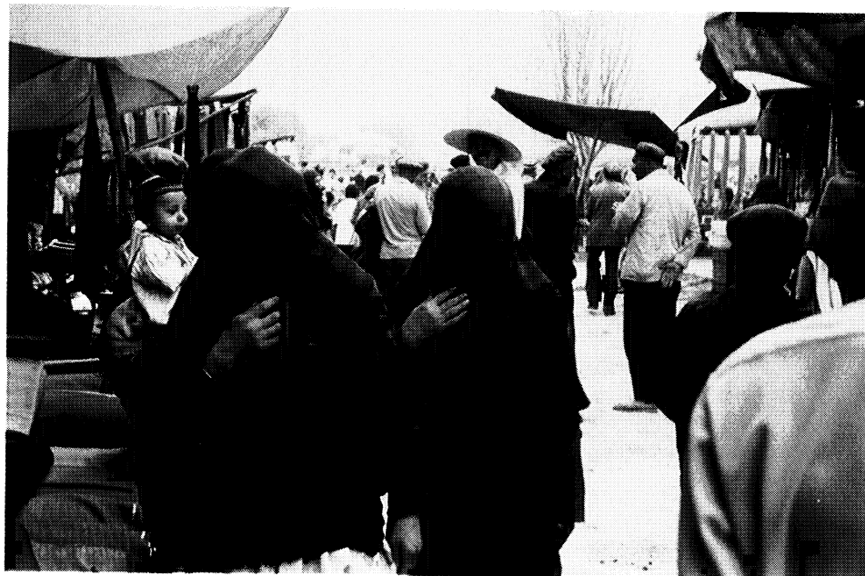
Figure 5. Uygur women in the Kashgar bazaar, traditionally covered in the Uygur chumperdab , September 1988.