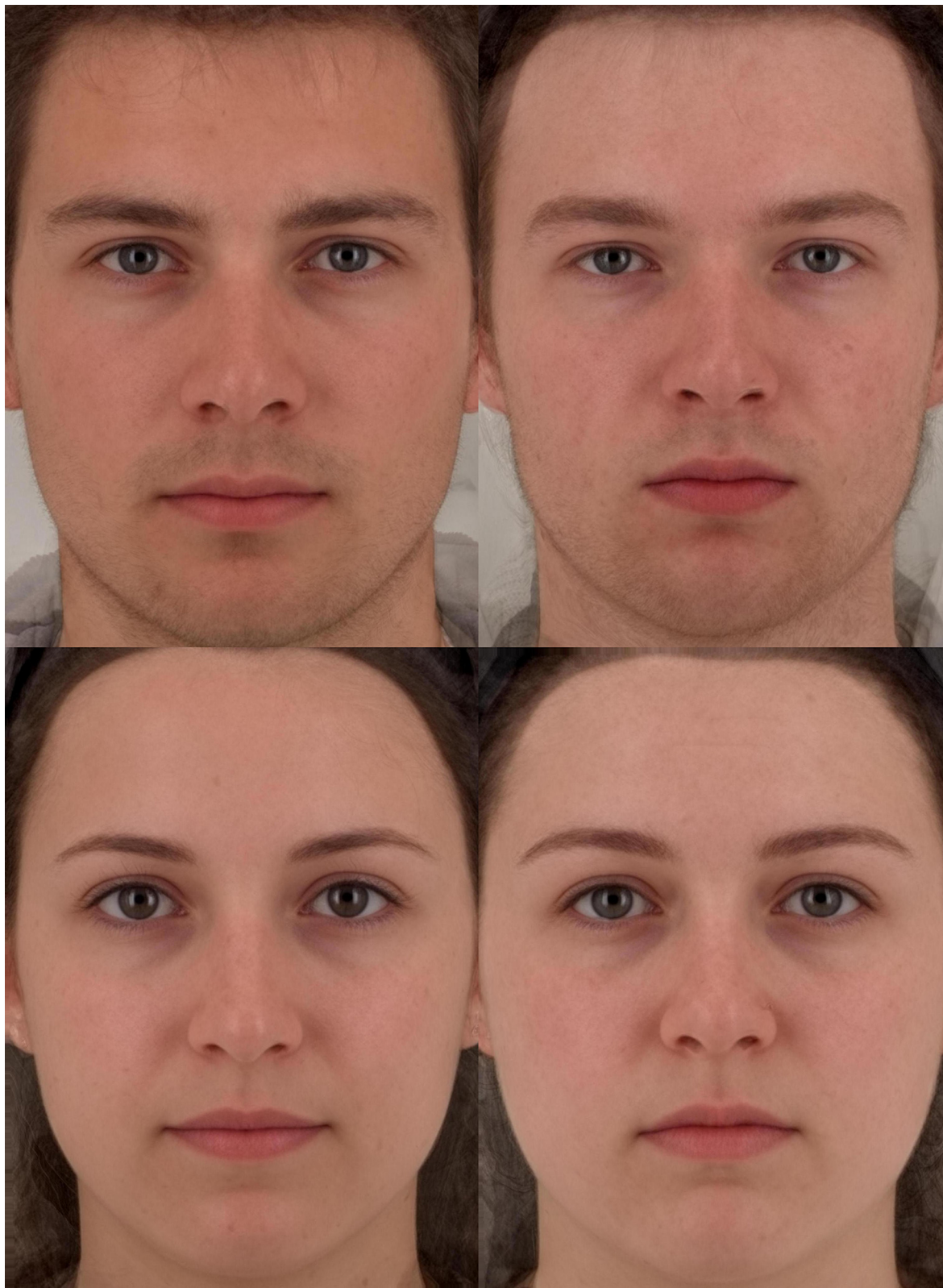
Fig 3. Attractiveness Suppression. This figure shows the noise in perceived conscientiousness (the overlap between perceived attractiveness and perceived conscientiousness) and how by suppressing this noise results in an improved predictor of actual academic performance (greater overlap between the remaining perceived conscientiousness and actual academic performance).