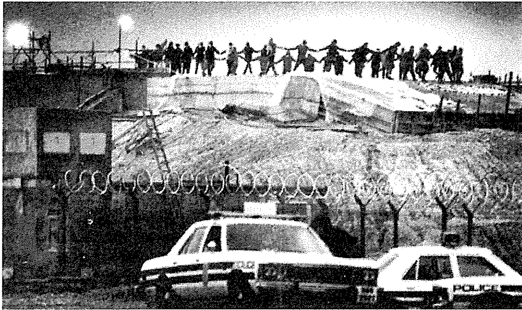
FIGURE 17. Women peace campaigners dance on a cruise missile silo inside the U.S. Air Force base at Greenham Common, England, 1983.