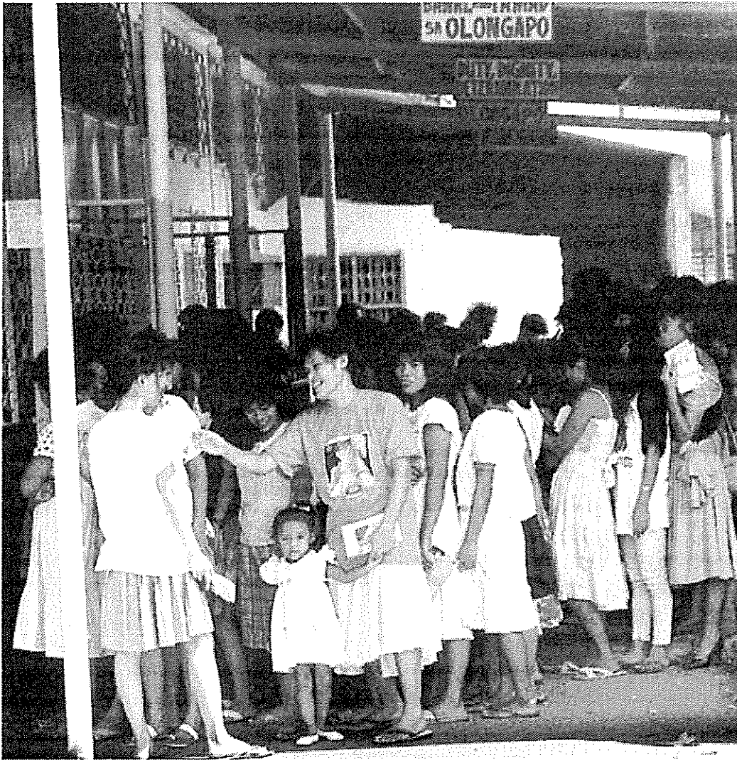
FIGURE 16. Filipino women working as entertainers around the U.S. Navy's Subic Bay base line up for compulsory VD and HIV/AIDS examinations, 1988. While the base was in operation, all such entertainers were required to undergo these examinations twice a month.

A complex Filipino antibases movement succeeded in persuading the Philippines Senate to vote against renewing the bilateral Status of Forces Agreement with the United States. In 1992, Subic Bay Naval Base and Clark Air Force Base were closed.