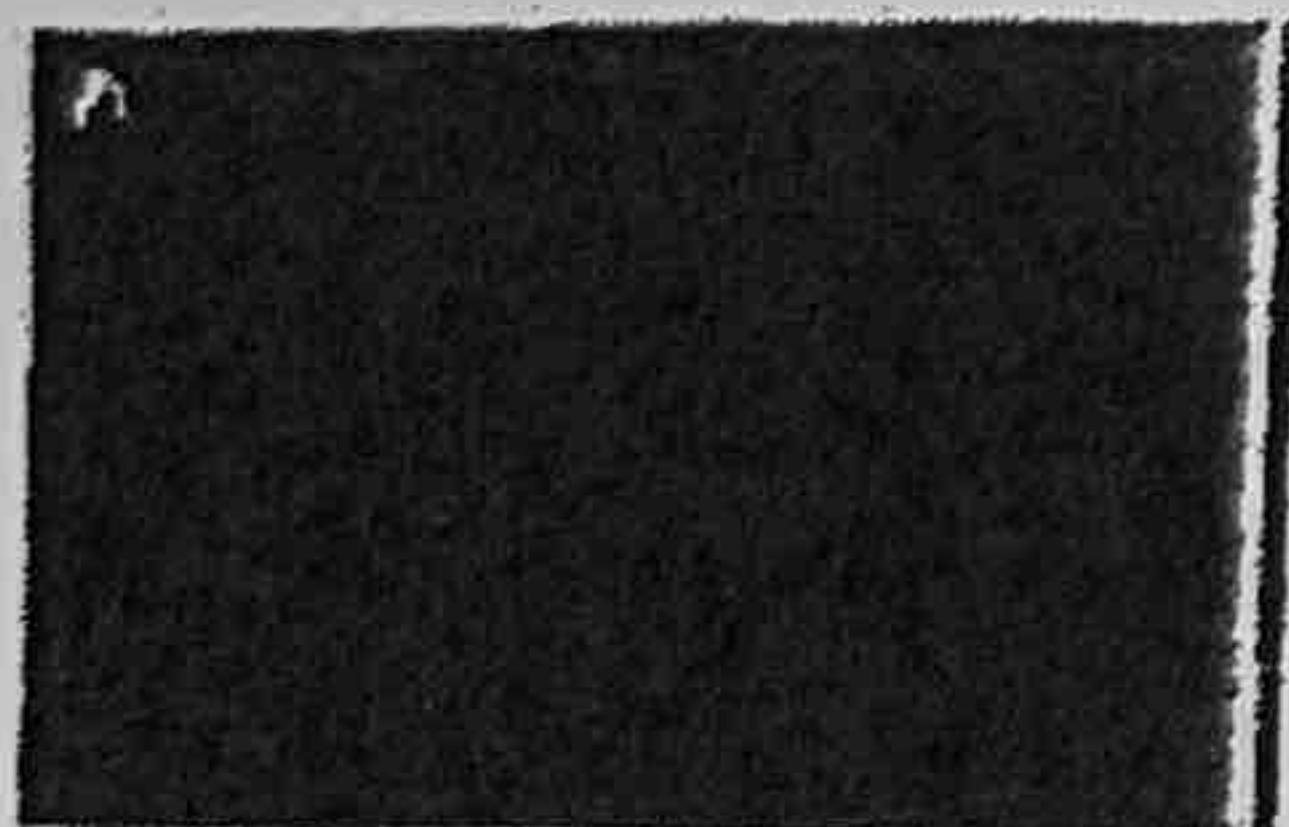
Figure 2. Male holotype of Hypsiboas gladiator (Kohler et al., 2010, p. 584).