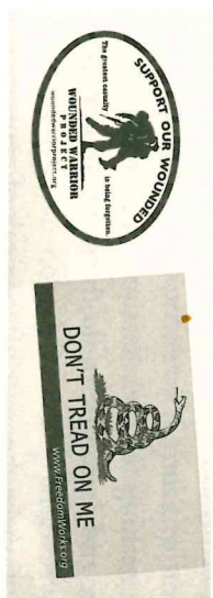
FIGURE 7.4. Liberal and conservative carting.

rock bands. The driver of the “Save Darfur” car is announcing that he or she is on the liberal team. You know that intuitively, but I can give a more formal reason: The moral matrix of liberals, in America and elsewhere, rests more heavily on the Care foundation than do the matrices of conservatives, and this driver has selected three bumper stickers urging people to protect innocent victims. 11 The driver has no relationship to these victims. The driver is trying to get you to connect your thinking about Darfur and meat-eating to the intuitions generated by your Care foundation.