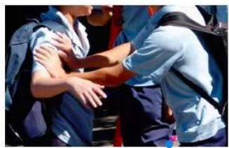
Bullying at school level

developed the sense that if they will talk, the other students will laugh and bully him (Klein 154). Through the act of bullying, the victim goes into the state of psychological depression and mental distress. About 14% of students considered suicide and almost 7% of the bullied students have attempted it because they think that they are useless and cannot do anything to maintain their self-respect and self-esteem. This is one of the biggest dilemmas of the 21st century that needs to be resolved. This issue can be resolved if the teachers have open communication with their students and encourage them to help others instead of teasing them and there is a need to engage parents on this matter.