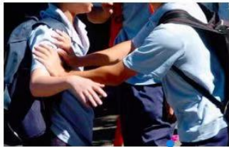
Bullying at school level

developed the sense that if they will talk, the other students will laugh and bully him (Klein 154). Through the act of bullying, the victim goes into the state of psychological depression and mental distress. About 14% of students considered suicide and almost 7% of the bullied students have attempted it because they think that they are useless and cannot do anything to maintain their self-respect and self-esteem. This is one of the biggest dilemmas of the 21st century that needs to be resolved. This issue can be resolved if the teachers have open communication with their students and encourage them to help others instead of teasing them and there is a need to engage parents on this matter.