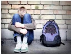
Bullying increases, the level of depression and anxiety

initiative is taken to stop the bullying within the school premises, then there are increased chances that this problem can be solved. In school, every child should be given the awareness about the concept of bullying, how it originated and how it is affecting the life of innocent children. All states have some forms of anti-bullying laws. There are also bullying prevention resources and different videos and blogs that helped a lot in dealing with the bullying. The federal laws should also be implemented because without implementing Laws the prevention of bullying is not possible. Addressing the issue through videos and workshops so not much and has proved to be an effective approach in giving education to the students as well as parents. Students should be given the information about the correct bullying definition. They think that bullying is another name of fun and entertainment; however, sometimes it takes the level of aggressiveness (Cross). In this education strategy, different individuals are taught that every act that hurts the feeling of the other person and shatters their feeling comes into the zone of bullying. Therefore, clear information and understanding about bullying plays a significant role in addressing the problem.