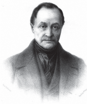
Figure 1.5 Auguste Comte is considered by many to be the father of sociology.

The term sociology was first coined in 1780 by the French essayist Emmanuel-Joseph Sieyès (1748–1836) in an unpublished manuscript (Fauré et al. 1999). In 1838, the term was reinvented by Auguste Comte (1798–1857). Comte originally studied to be an engineer, but later became a pupil of social philosopher Claude Henri de Rouvroy Comte de Saint-Simon (1760–1825). They both thought that social scientists could study society using the same scientific methods utilized in natural sciences. Comte also believed in the potential of social scientists to work toward the betterment of society. He held that once scholars identified the laws that governed society, sociologists could address problems such as poor education and poverty (Abercrombie et al. 2000).