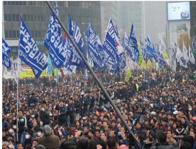
Figure 1.7 Sociologists develop theories to explain social occurrences such as protest rallies.

Sociologists study social events, interactions, and patterns, and they develop a theory in an attempt to explain why things work as they do. In sociology, a theory is a way to explain different aspects of social interactions and to create a testable proposition, called a hypothesis , about society (Allan 2006).