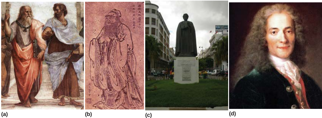
Figure 1.4 People have been thinking like sociologists long before sociology became a separate academic discipline: Plato and Aristotle, Confucius, Khaldun, and Voltaire all set the stage for modern sociology.

Since ancient times, people have been fascinated by the relationship between individuals and the societies to which they belong. Many topics studied in modern sociology were also studied by ancient philosophers in their desire to describe an ideal society, including theories of social conflict, economics, social cohesion, and power (Hannoum 2003).