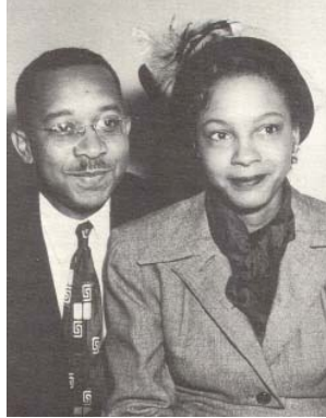
Figure 1.9 The research of sociologists Kenneth and Mamie Clark helped the Supreme Court decide to end “separate but equal” racial segregation in schools in the United States.

When Elizabeth Eckford tried to enter Central High School in Little Rock, Arkansas, in September 1957, she was met by an angry crowd. But she knew she had the law on her side. Three years earlier in the landmark Brown vs. the Board of Education case, the U.S. Supreme Court had overturned twenty-one state laws that allowed blacks and whites to be taught in separate school systems as long as the school systems were “equal.” One of the major factors influencing that decision was research conducted by the husband-and-wife team of sociologists, Kenneth and Mamie Clark. Their research showed that segregation was harmful to young black schoolchildren, and the Court found that harm to be unconstitutional.