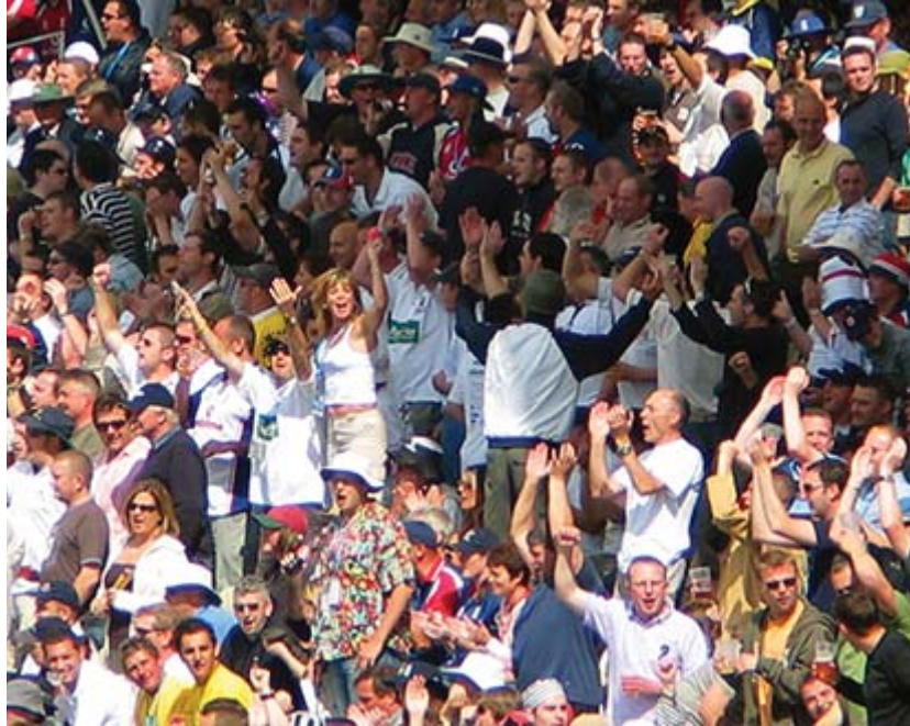
Figure 1.2 Sociologists learn about society as a whole while studying one-to-one and group interactions.