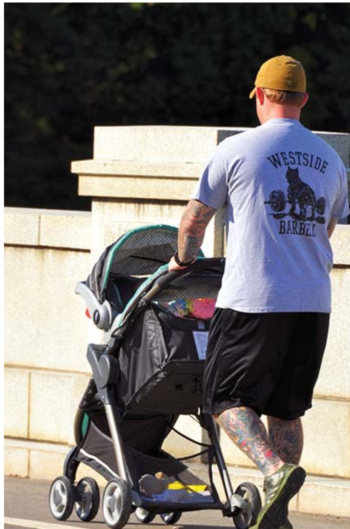
Figure 1.3 Modern U.S. families may be very different in structure from what was historically typical.

Some sociologists study social facts , which are the laws, morals, values, religious beliefs, customs, fashions, rituals, and all of the cultural rules that govern social life, that may contribute to these changes in the family. Do people in the United States view marriage and family differently than before? Do employment and economic conditions play a role? How has culture influenced the choices that individuals make in living arrangements? Other sociologists are studying the consequences of these new patterns, such as the ways children are affected by them or changing needs for education, housing, and healthcare.