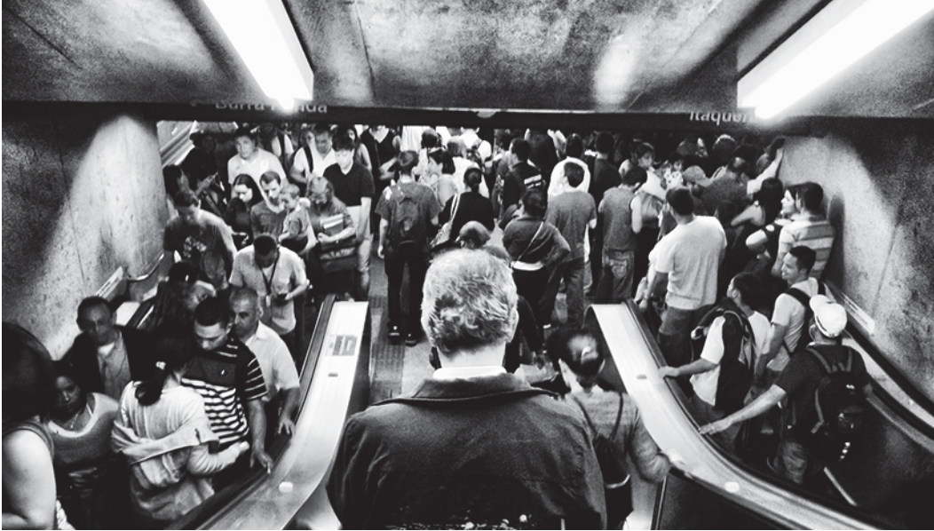
Figure 1.1 Sociologists study how society affects people and how people affect society.