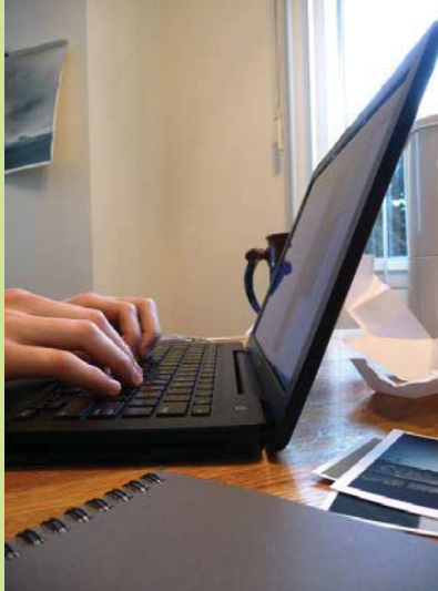
Figure 1.8 Some sociologists see the online world contributing to the creation of an emerging global culture. Are you a part of any global communities?

Sociologists around the world look closely for signs of what would be an unprecedented event: the emergence of a global culture. In the past, empires such as those that existed in China, Europe, Africa, and Central and South America linked people from many different countries, but those people rarely became part of a common culture. They lived too far from each other, spoke different languages, practiced different religions, and traded few goods. Today, increases in communication, travel, and trade have made the world a much smaller place. More and more people are able to communicate with each other instantly—wherever they are located—by telephone, video, and text. They share movies, television shows, music, games, and information over the Internet. Students can study with teachers and pupils from the other side of the globe. Governments find it harder to hide conditions inside their countries from the rest of the world.