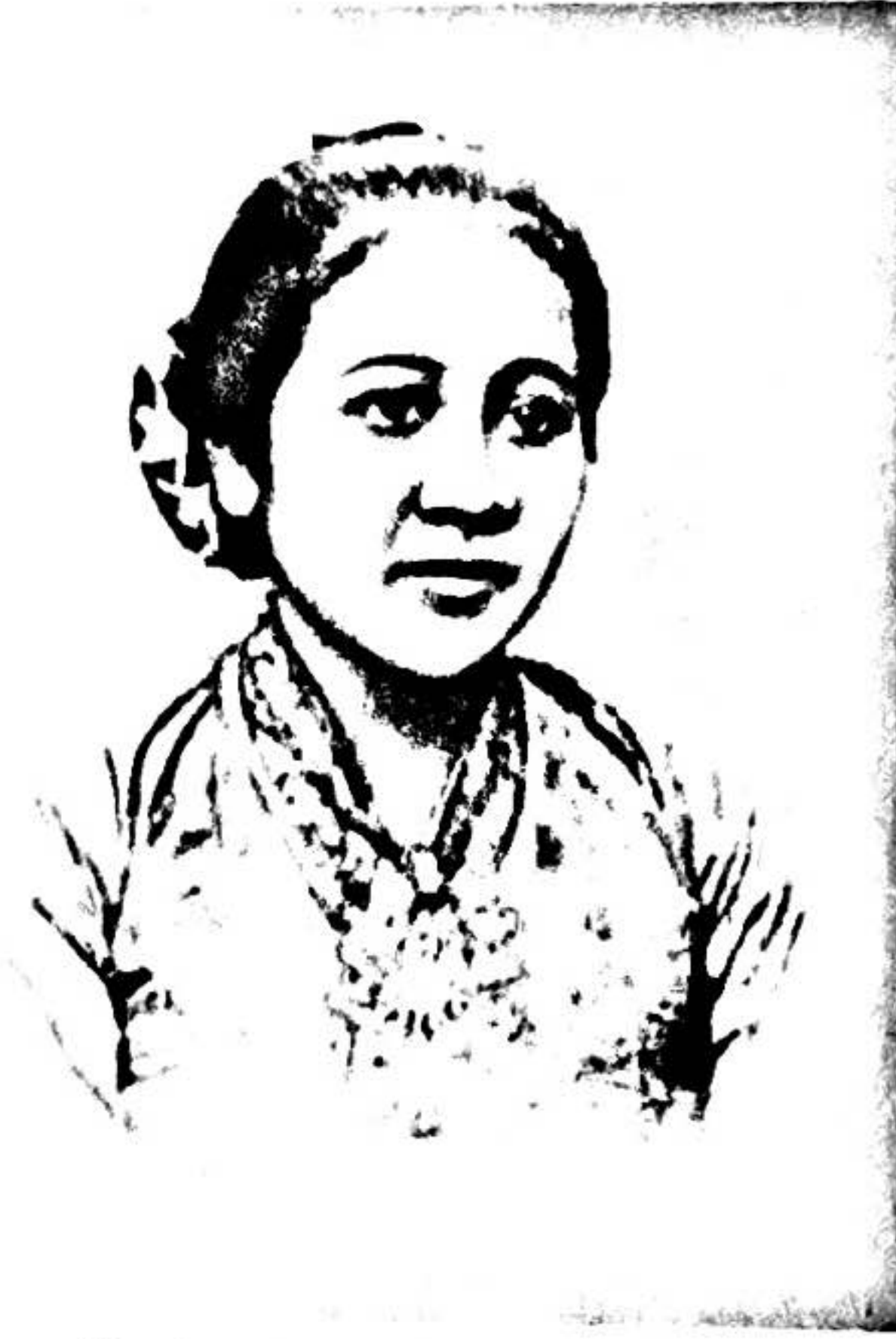
Kartini

Through her father, a high official in the Dutch colonial administration who much admired Western education, Kartini still had access to Dutch books, and later, she was tutored by several Europeans, including one woman with strong socialist and feminist leanings. She also read widely on her own and began an extensive correspon-