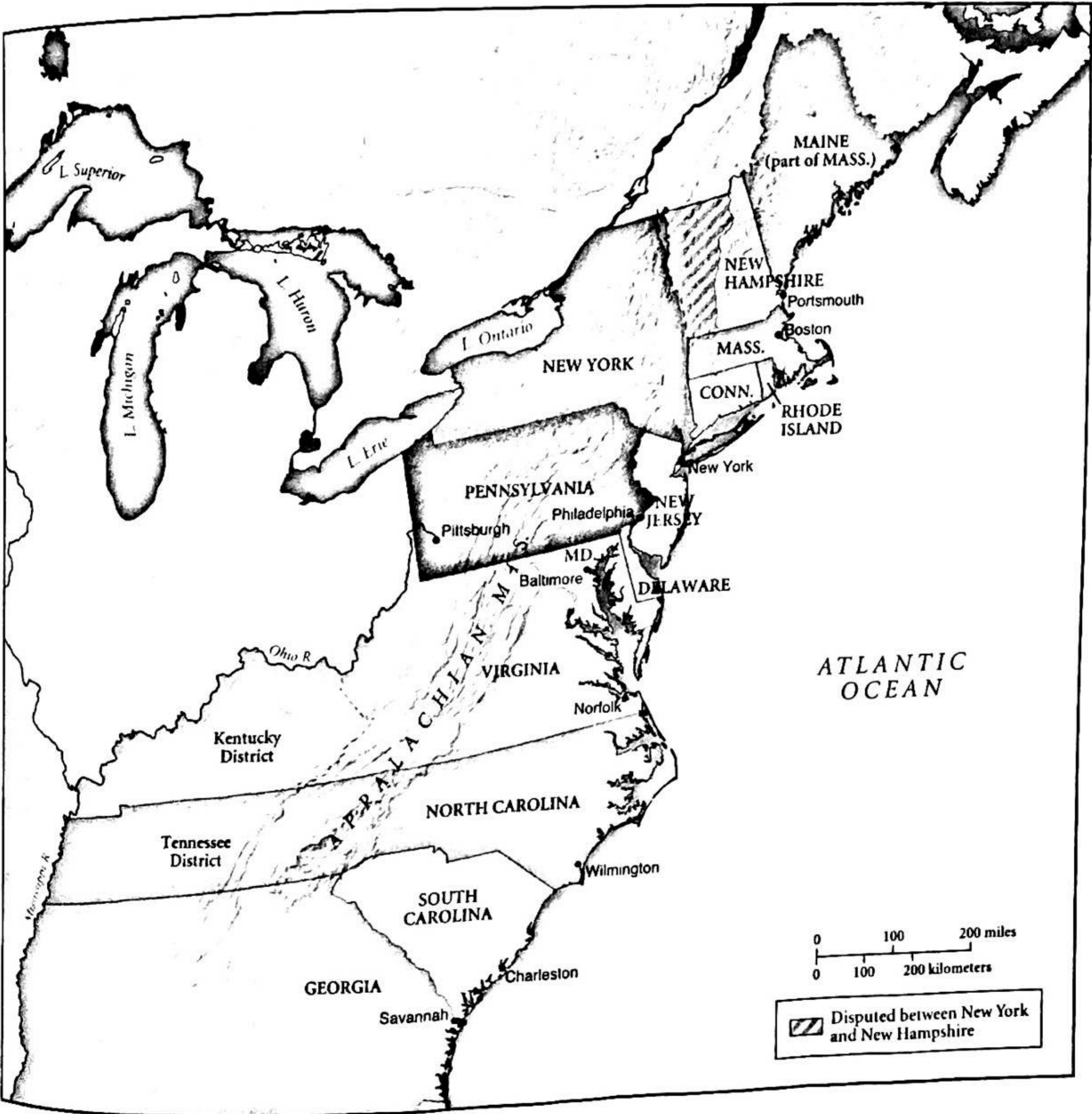
Map 16.1 The United States after the American Revolution The union of the thirteen British colonies in North America created the embryonic United States, shown here in 1788. Over the past two centuries and more of anticolonial struggles, it was the only example of separate colonies joining together after independence to form a larger and enduring nation.

Change What was revolutionary about the American Revolution, and what was not?