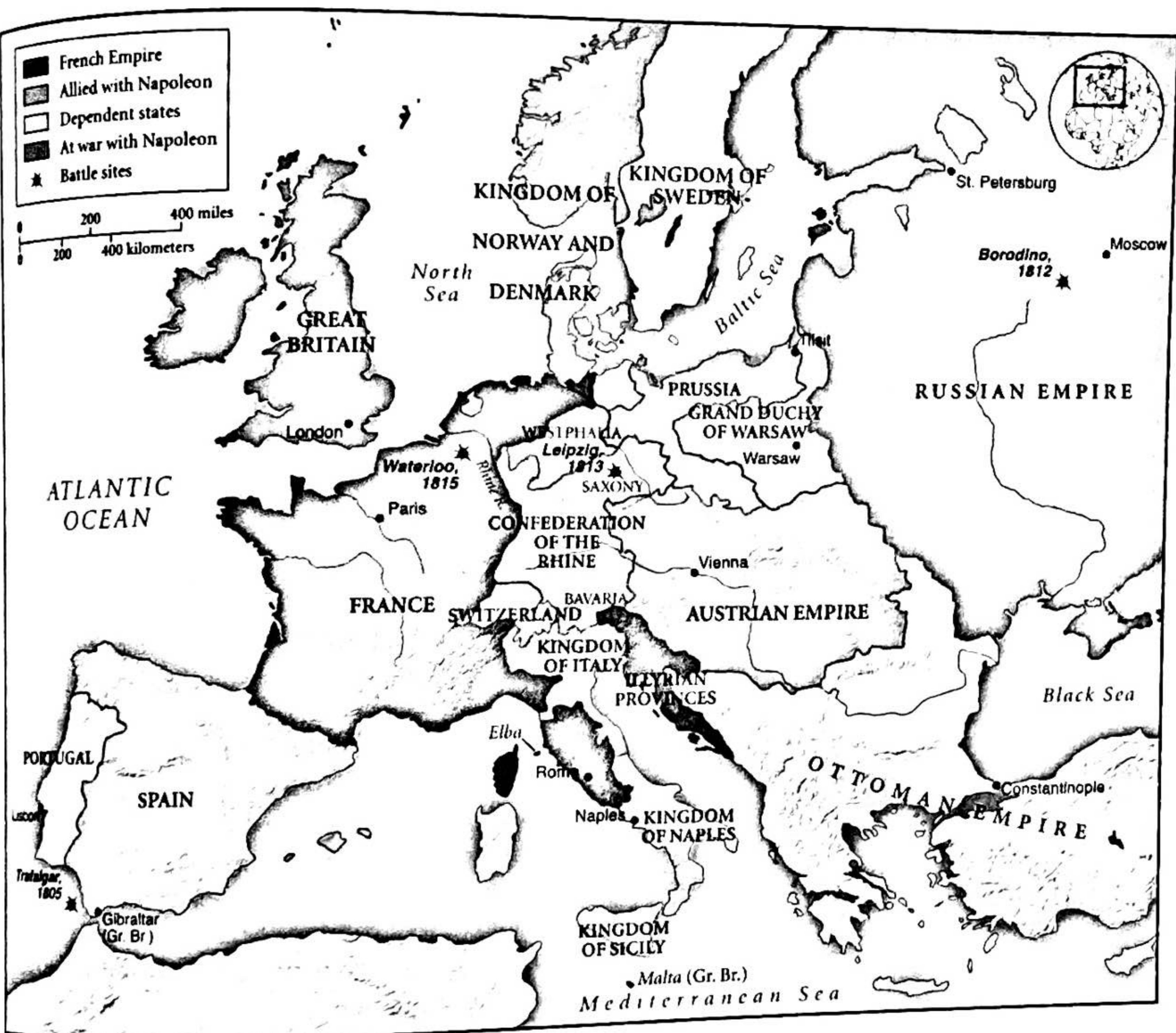
Map 16.2 Napoleon's European Empire The French Revolution spawned a French empire, under Napoleon's leadership, that encompassed most of Europe and served to spread the principles of the revolution.

Oh Liberty, sacred Liberty Goddess of an enlightened people Rule today within these walls. Through you this temple is purified. Liberty! Before you reason chases out deception, Error flees, fanaticism is beaten down. Our gospel is nature And our cult is virtue. To love one's country and one's brothers, To serve the Sovereign People — These are the sacred tenets And pledge of a Republican. 11