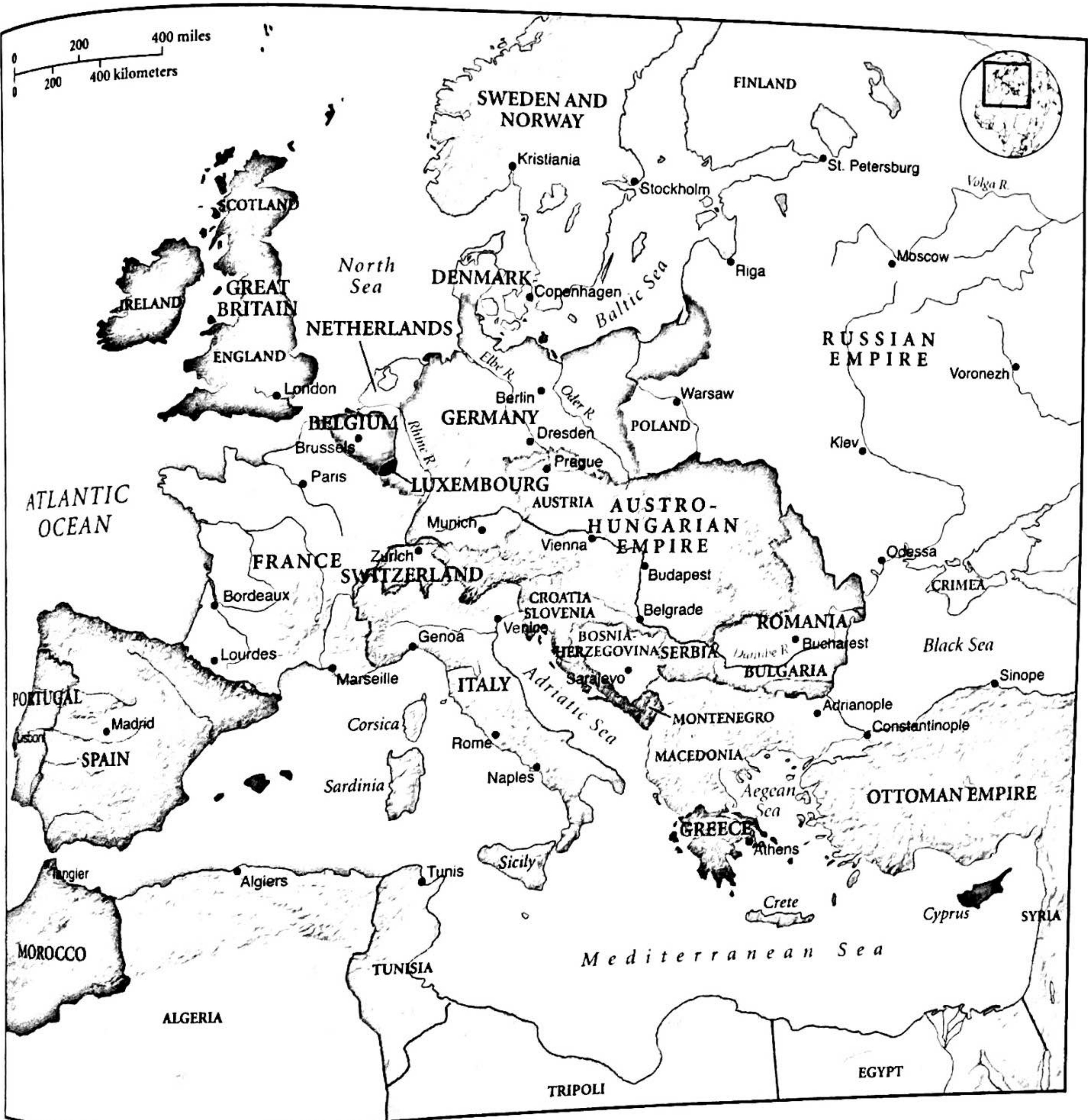
Map 16.4 The Nations and Empires of Europe, ca. 1880

By the end of the nineteenth century, the national principle had substantially reshaped the map of Europe, especially in the unification of Germany and Italy. However, several major empires (Russian, Austro-Hungarian, and Ottoman) remained, each with numerous subject peoples who likewise sought national independence.