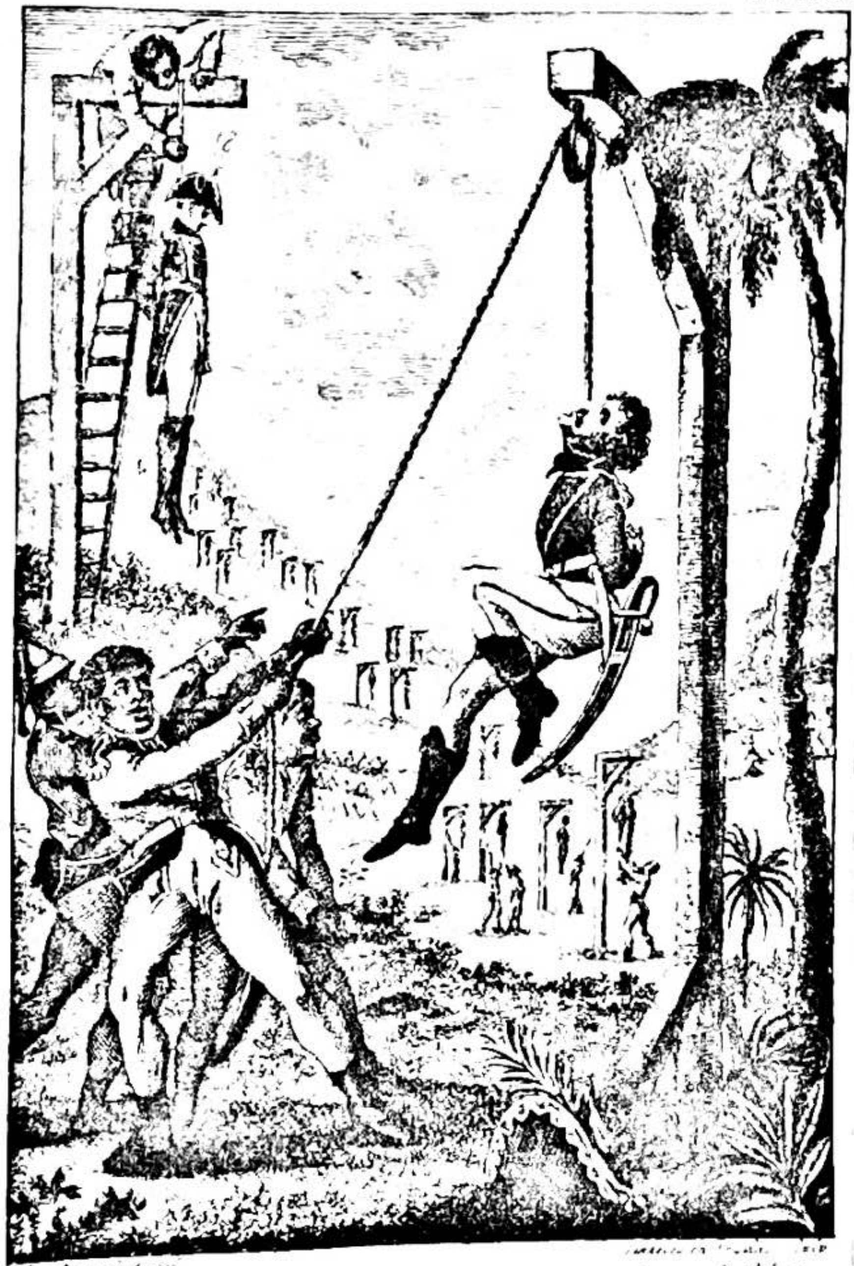
Wraak: door het leger der zwarten genomen van de wreedheden, hun door de Franſchen aangedaan.

When the dust settled in the early years of the nineteenth century, it was clear that something remarkable and unprecedented had taken place, a revolution unique in the Atlantic world and in world history. Socially, the last had become first. In the only completely successful slave revolt in world history, “the lowest order of the society—slaves—became equal, free, and independent citizens.” 12 Politically, they had thrown off French colonial rule, becoming the second independent republic in the Americas and the first non-European state to emerge from Western colonialism. They renamed their country “Haiti,” a term meaning “mountainous” or “rugged” in the language of the original Taino people. It was a symbolic break with Europe and represented