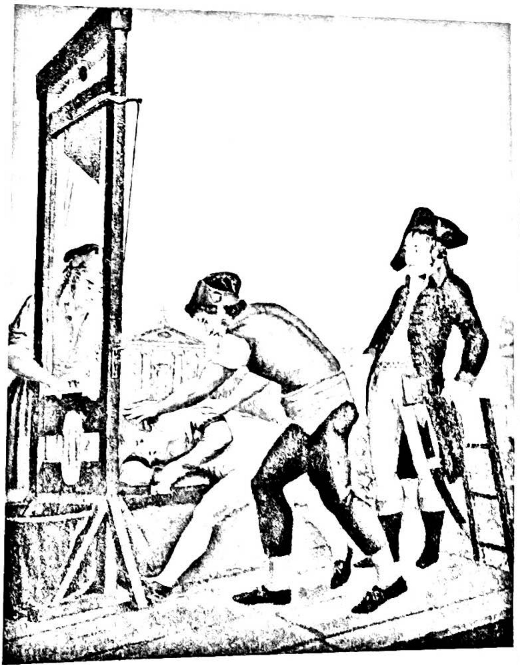
The Execution of Robespierre The beheading of the radical leader Robespierre, who had himself brought thousands of others to the guillotine, marked a decisive turning point in the unfolding of the French Revolution and the end of its most violent phase.

In terms of gender roles, the French Revolution did not create a new society, but it did raise the question of female political equality far more explicitly than the American Revolution had done. Partly this was because French women were active in the major events of the revolution. In July 1789, they took part in the famous storming of the Bastille, a large fortress, prison, and armory that had come to symbolize the oppressive old regime. In October of that year, some 7,000 Parisian women, desperate about the shortage of bread, marched on the palace at Versailles, stormed through