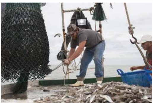
Under Chapter 12, what is the definition of a "family fisherman"?

A family fisherman is one whose gross income is at least 50 percent dependent on commercial fishing operations and whose debts are at least 80 percent related to commercial fishing. The total debt for a family fisherman must not exceed $1,924,550. As with family farmers, a partnership or close corporation can also qualify.