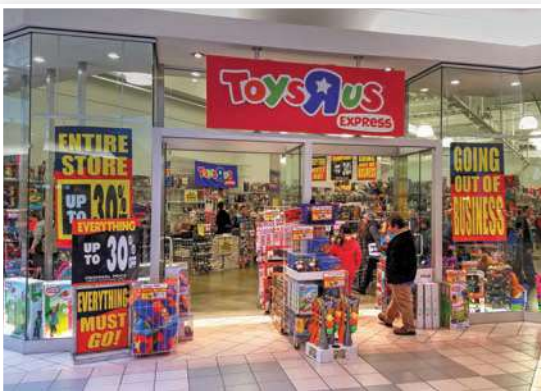
What are some factors that can cause large retail chains, such as Toys R Us, to file for bankruptcy?

We can expect to see brick-and-mortar retailers forced into Chapter 11 reorganization for many years to come. Not only is Amazon, the Internet's biggest retailer, expanding every year, but traditional retailers are shifting resources away from physical stores and learning how to increase their online presence.