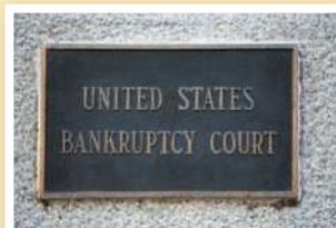
What constitutes a false oath in Chapter 7 proceedings?

Background and Facts Clarence and Pamela Cummings filed a petition for a Chapter 7 bankruptcy in a federal bankruptcy court. After the debtors filed two amended versions of the required schedules, the trustee asked for additional time to investigate. The court granted the request. The debtors then filed a third amended schedule. In it, they disclosed