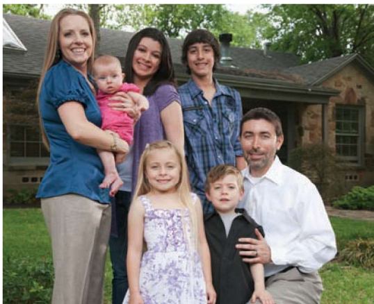
How does family size affect the calculation and application of the means test?

Order for Relief A court's grant of assistance to a debtor in bankruptcy that relieves the debtor of the immediate obligation to pay debts.