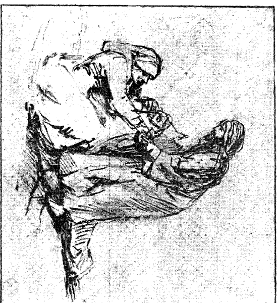
Rembrandt van Rijn: Christ Healing the Sick . Gestures of comfort are universally recognizable and reflect the healing power of attuned touch.

Mainstream trauma treatment has paid scant attention to helping terrified people to safely experience their sensations and emotions. Medications such as serotonin reuptake blockers, Risperidol and Serquel increasingly have taken the place of helping people to deal with their sensory world. 28 However, the most natural way that we humans calm down our distress is by being touched, hugged, and rocked. This helps with excessive arousal and makes us feel intact, safe, protected, and in charge.