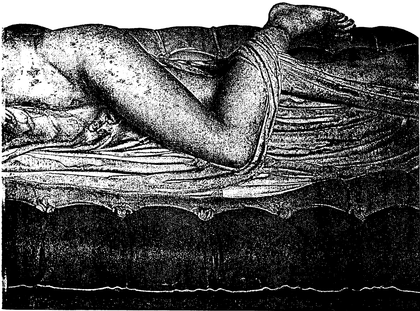
Sleeping Hermaphrodite, Roman, Second Century B.C.

In reality though, few such students would make it as