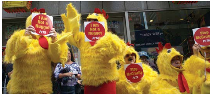
Figure 7.4 Functionalists believe that deviance plays an important role in society and can be used to challenge people's views. Protesters, such as these PETA members, often use this method to draw attention to their cause.

Why does deviance occur? How does it affect a society? Since the early days of sociology, scholars have developed theories that attempt to explain what deviance and crime mean to society. These theories can be grouped according to the three major sociological paradigms: functionalism, symbolic interactionism, and conflict theory.