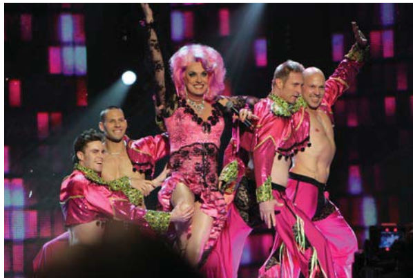
Figure 7.2 Much of the appeal of watching entertainers perform in drag comes from the humor inherent in seeing everyday norms violated.

What, exactly, is deviance? And what is the relationship between deviance and crime? According to sociologist William Graham Sumner, deviance is a violation of established contextual, cultural, or social norms, whether folkways, mores, or codified law (1906). It can be as minor as picking your nose in public or as major as committing murder. Although the word “deviance” has a negative connotation in everyday language, sociologists recognize that deviance is not necessarily bad (Schoepflin 2011). In fact, from a structural functionalist perspective, one of the positive contributions of deviance is that it fosters social change. For example, during the U.S. civil rights movement, Rosa Parks violated social norms when she refused to move to the “black section” of the bus, and the Little Rock Nine broke customs of segregation to attend an Arkansas public school.