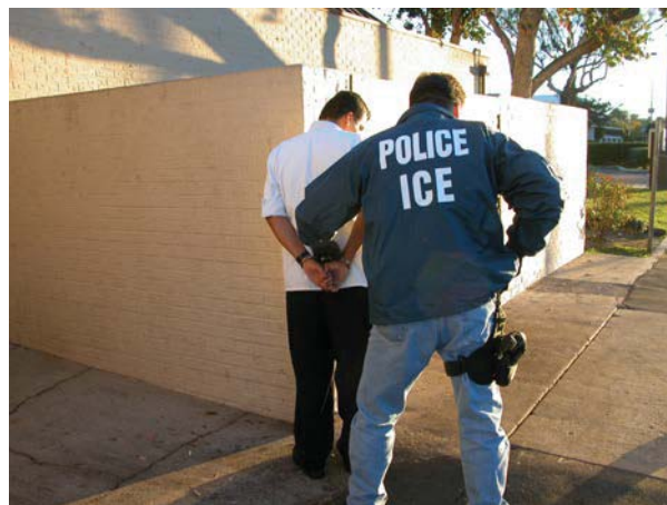
Figure 7.8 How is a crime different from other types of deviance?

Although deviance is a violation of social norms, it's not always punishable, and it's not necessarily bad. Crime , on the other hand, is a behavior that violates official law and is punishable through formal sanctions. Walking to class backward is a deviant behavior. Driving with a blood alcohol percentage over the state's limit is a crime. Like other forms of deviance, however, ambiguity exists concerning what constitutes a crime and whether all crimes are, in fact, "bad" and deserve punishment. For example, during the 1960s, civil rights activists often violated laws intentionally as part of their effort to bring about racial equality. In hindsight, we recognize that the laws that deemed many of their actions