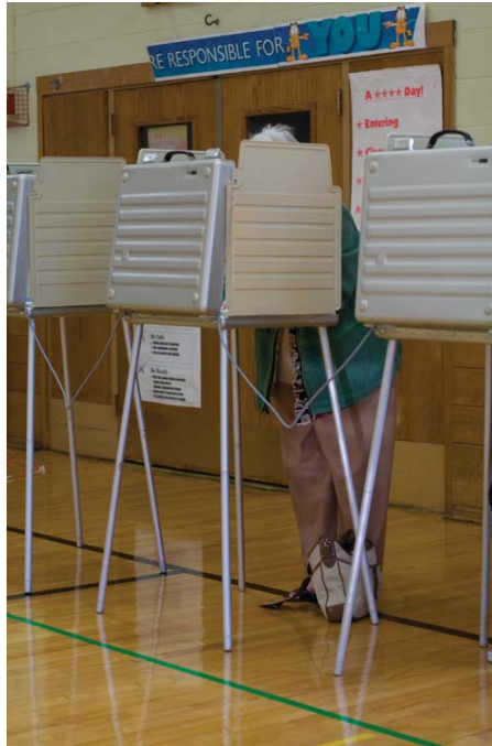
Figure 7.7 Should a former felony conviction permanently strip a U.S. citizen of the right to vote?