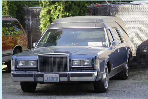
Figure 7.3 A hearse with the license plate "LASTRYD." How would you view the owner of this car?

Schoepflin theorized that, although viewed as outside conventional norms, driving a hearse is such a mild form of deviance that it actually becomes a mark of distinction. Conformists find the choice of vehicle intriguing or appealing, while nonconformists see a fellow oddball to whom they can relate. As one of Bill's friends remarked, "Every guy wants to own a unique car like this, and you can certainly pull it off." Such anecdotes remind us that although deviance is often viewed as a violation of norms, it's not always viewed in a negative light (Schoepflin 2011).