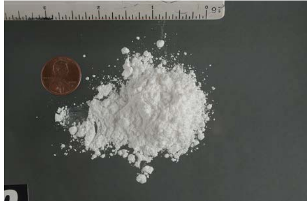
Figure 7.6 From 1986 until 2010, the punishment for possessing crack, a “poor person’s drug,” was 100 times stricter than the punishment for cocaine use, a drug favored by the wealthy.

versus cocaine paralleled the unequal social class of respective users. A conflict theorist would note that those in society who hold the power are also the ones who make the laws concerning crime. In doing so, they make laws that will benefit them, while the powerless classes who lack the resources to make such decisions suffer the consequences. The crack-cocaine punishment disparity remained until 2010, when President Obama signed the Fair Sentencing Act, which decreased the disparity to 1 to 18 (The Sentencing Project 2010).