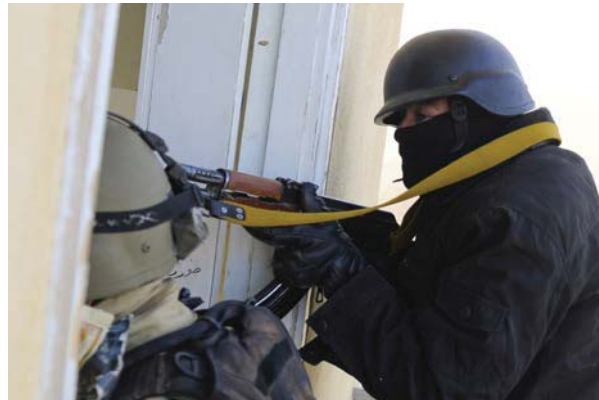
Figure 7.10 Here, Afghan National Police Crisis Response Unit members train in Surobi, Afghanistan.

State police have the authority to enforce statewide laws, including regulating traffic on highways. Local or county police, on the other hand, have a limited jurisdiction with authority only in the town or county in which they serve.