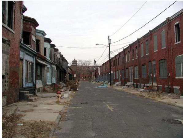
Figure 7.5 Proponents of social disorganization theory believe that individuals who grow up in impoverished areas are more likely to participate in deviant or criminal behaviors.

Developed by researchers at the University of Chicago in the 1920s and 1930s, social disorganization theory asserts that crime is most likely to occur in communities with weak social ties and the absence of social control. An individual who grows up in a poor neighborhood with high rates of drug use, violence, teenage delinquency, and deprived parenting is more likely to become a criminal than an individual from a wealthy neighborhood with a good school system and families who are involved positively in the community.