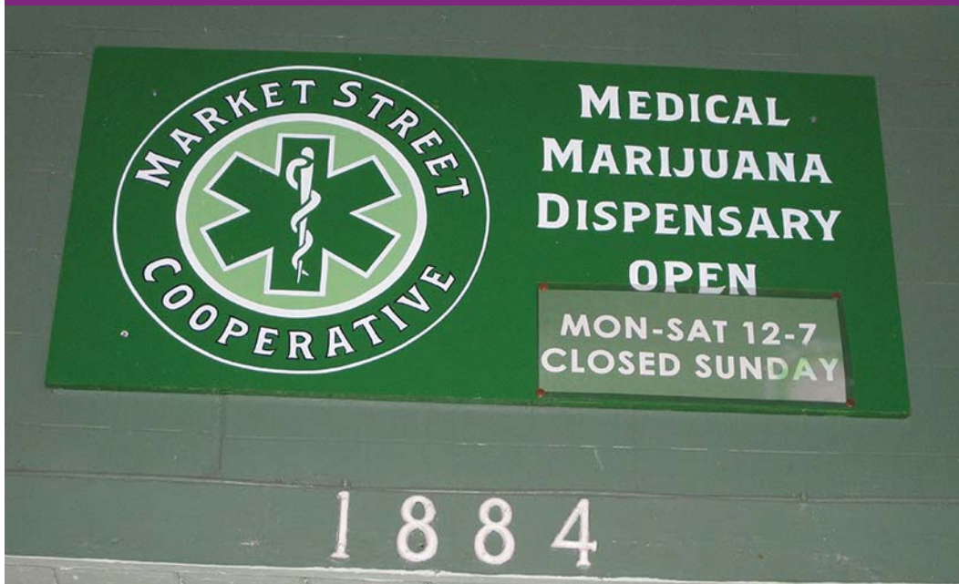
Figure 7.1 Washington is one of several states where marijuana use has been legalized, decriminalized, or approved for medical use.