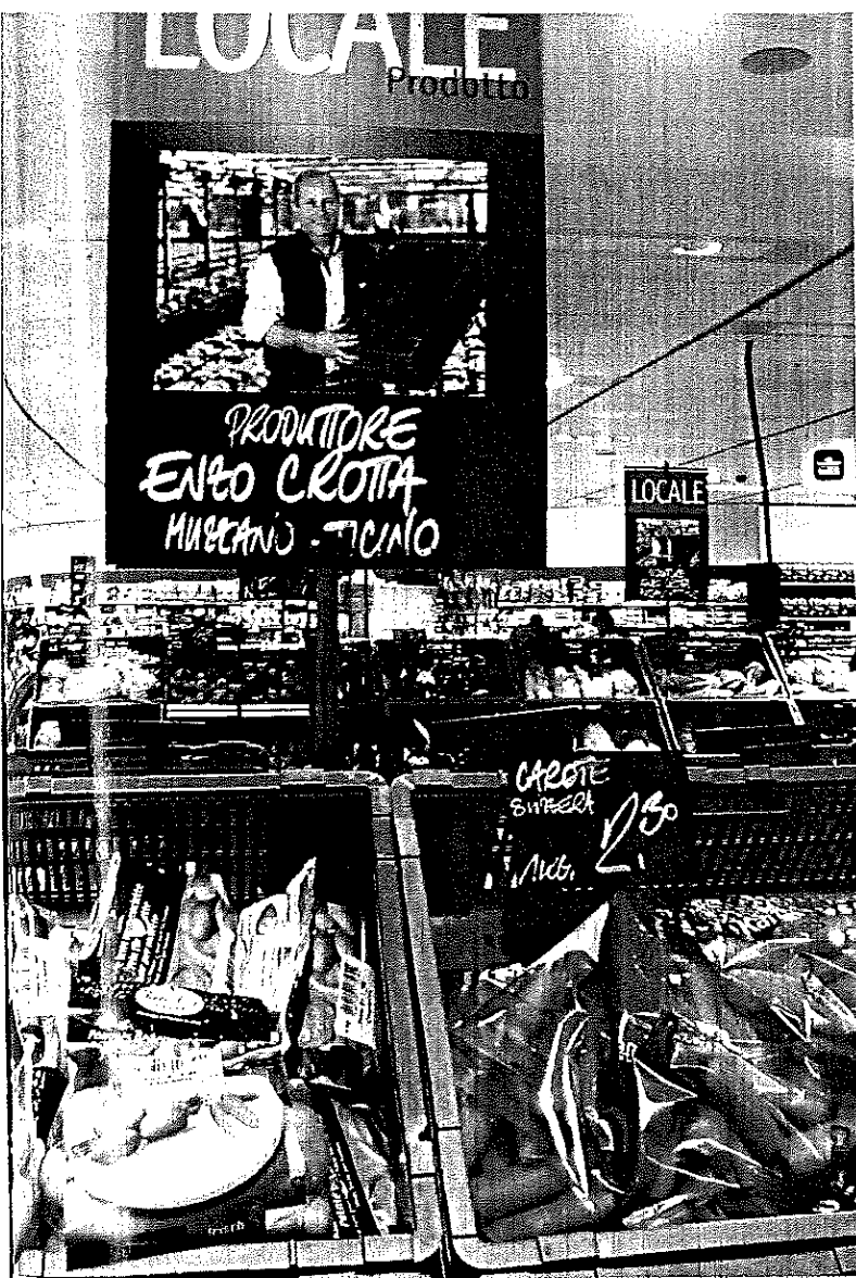
▲ Figure 8.6 Promoting local economies Increasing awareness of the benefits of locally produced foods has encouraged many supermarkets, like this one in Lugano, Switzerland, to feature local products.

economies where production, consumption, and decision making are oriented to local needs and conditions (Figure 8.6).