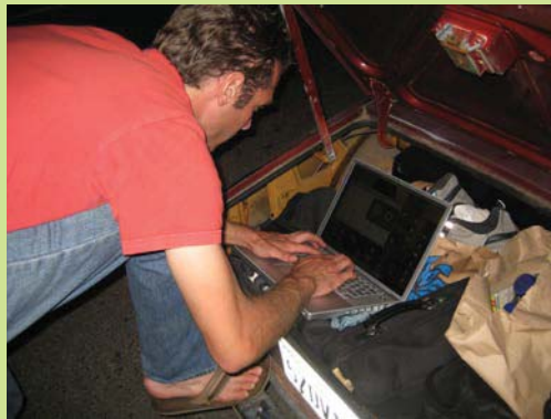
Figure 21.7 In 2008, Obama's campaign used social media to tweet, like, and friend its way to victory.

Chances are you have been asked to tweet, friend, like, or donate online for a cause. Maybe you were one of the many people who, in 2010, helped raise over $3 million in relief efforts for Haiti through cell phone text donations. Or maybe you follow presidential candidates on Twitter and retweet their messages to your followers. Perhaps you have “liked” a local nonprofit on Facebook, prompted by one of your neighbors or friends liking it too. Nowadays, social movements are woven throughout our social media activities. After all, social movements start by activating people.