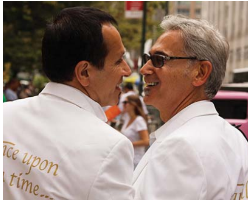
Figure 21.6 At the time of this writing, more than thirty states and the District of Columbia allow marriage for same-sex couples. State constitutional bans are more difficult to overturn than mere state bans because of the higher threshold of votes required to change a constitution. Now that the Supreme Court has stricken a key part of the Defense of Marriage Act, same-sex couples married in states that allow it are now entitled to federal benefits afforded to heterosexual couples (CNN 2014).

A movement on the opposite end is the National Organization for Marriage, an organization that funds campaigns to stop same-sex marriage (National Organization for Marriage 2014). Both these organizations work on the national stage and seek to engage people through grassroots efforts to push their message. In February 2011, U.S. Attorney General Eric Holder released a statement saying President Barack Obama had concluded that “due to a number of factors, including a documented history of discrimination, classification based on sexual orientation should be subject to a more heightened standard of scrutiny.” The statement said, “Section 3 of DOMA [the Defense of Marriage Act of 1993], as applied to legally married same-sex couples, fails to meet that standard and is therefore unconstitutional.” With that the Department was instructed not to defend the statute in such cases (Department of Justice, Office of Public Affairs 2011; AP/Huffington Post 2011).