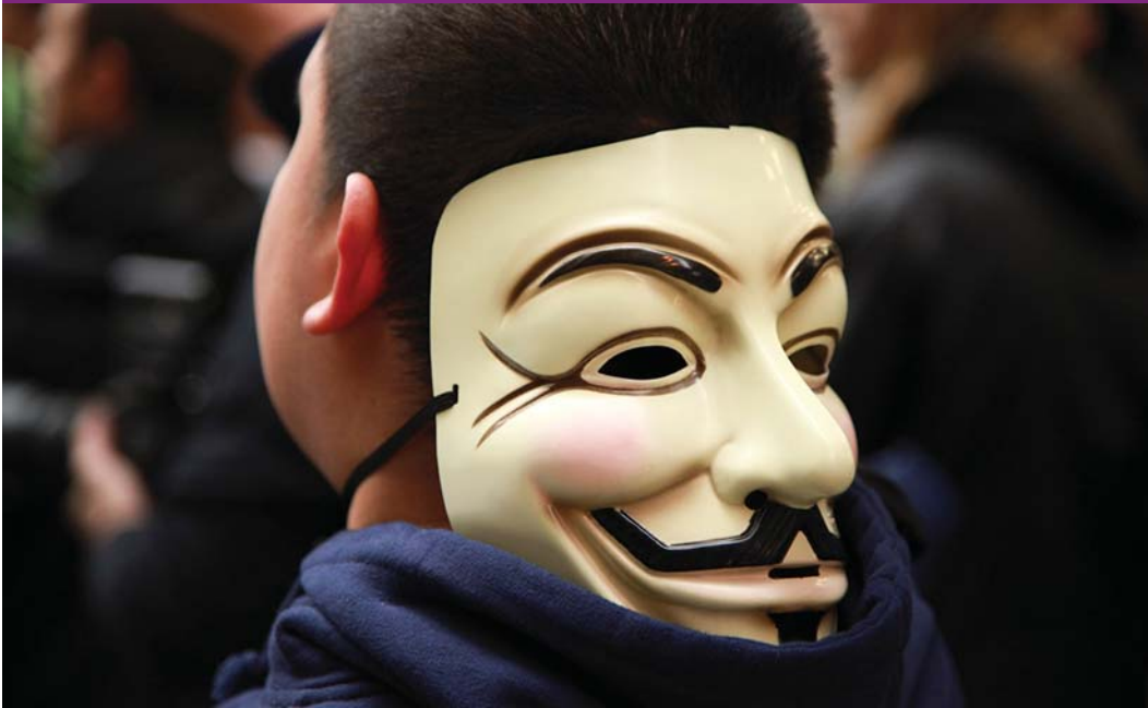
Figure 21.1 In many ways, this mask, which perhaps became infamous due to its use by the "hacktivist" group Anonymous, has come to stand for revolution and social change around the world.