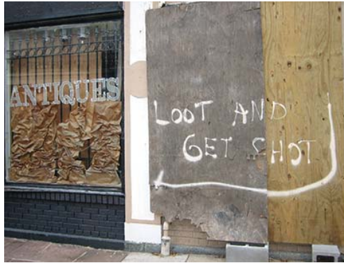
Figure 21.3 According to the emergent-norm perspective, Hurricane Katrina victims sought supplies for survival, but to outsiders their behavior would normally be seen as looting.

Sociologists Ralph Turner and Lewis Killian (1993) built on earlier sociological ideas and developed what is known as emergent norm theory. They believe that the norms experienced by people in a crowd may be disparate and fluctuating. They emphasize the importance of these norms in shaping crowd behavior, especially those norms that shift quickly in response to changing external factors. Emergent norm theory asserts that, in this circumstance, people perceive and respond to the crowd situation with their particular (individual) set of norms, which may change as the crowd experience evolves. This focus on the individual component of interaction reflects a symbolic interactionist perspective.