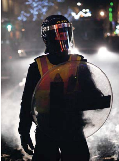
Figure 21.4 Agents of social control bring collective behavior to an end.

that the police were not acting in the people's interest and were withholding the name of the officer, structural strain became evident. A growing generalized belief evolved as the crowd of protesters were met with heavily armed police in military-style protective uniforms accompanied by an armored vehicle. The precipitating factor of the arrival of the police spurred greater collective behavior as the residents mobilized by assembling a parade down the street. Ultimately they were met with tear gas, pepper spray, and rubber bullets used by the police acting as agents of social control. The element of social control escalated over the following days until August 18, when the governor called in the National Guard.