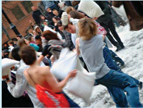
Figure 21.2 Is this a good time had by all? Some flash mobs may function as political protests, while others are for fun. This flash mob pillow fight's purpose was to entertain.

In March 2014, a group of musicians got together in a fish market in Odessa for a spontaneous performance of Beethoven's "Ode to Joy" from his Ninth Symphony. While tensions were building over Ukraine's efforts to join the European Union, and even as Russian troops had taken control of the Ukrainian airbase in Belbek, the Odessa Philharmonic Orchestra and Opera Chorus tried to lighten the troubled times for shoppers with music and song.