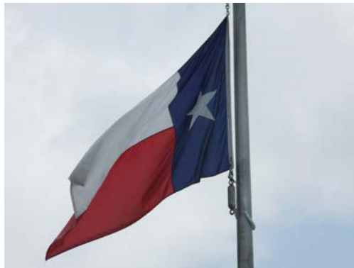
Figure 21.5 Texas Secede! is an organization which would like Texas to secede from the United States.

At the other end of the political spectrum from AREA Chicago is the Texas Secede! social movement in Texas. This statewide organization promotes the idea that Texas can and should secede from the United States to become an independent republic. The organization, which as of 2014 has over 6,000 “likes” on Facebook, references both Texas and national history in promoting secession. The movement encourages Texans to return to their rugged and individualistic roots, and to stand up to what proponents believe is the theft of their rights and property by the U.S. government (Texas Secede! 2009).