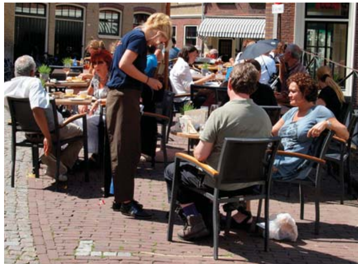
Figure 2.7 Is she a working waitress or a sociologist conducting a study using participant observation?

Rothman had conducted a form of study called participant observation , in which researchers join people and participate in a group’s routine activities for the purpose of observing them within that context. This method lets researchers experience a specific aspect of social life. A researcher might go to great lengths to get a firsthand look into a trend, institution, or behavior. Researchers temporarily put themselves into roles and record their observations. A researcher might work as a waitress in a diner, live as a homeless person for several weeks, or ride along with police officers as they patrol their regular beat. Often, these researchers try to blend in seamlessly with the population they study, and they may not disclose their true identity or purpose if they feel it would compromise the results of their research.