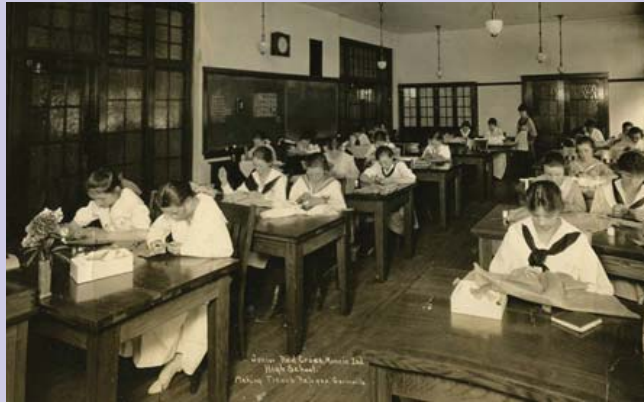
Figure 2.9 A classroom in Muncie, Indiana, in 1917, five years before John and Helen Lynd began researching this “typical” U.S. community.

Nothing like it had ever been done before. Middletown was reviewed on the front page of the New York Times . Readers in the 1920s and 1930s identified with the citizens of Muncie, Indiana, but they were equally fascinated by the sociological methods and the use of scientific data to define ordinary people in the United States. The book was proof that social data was important—and interesting—to the U.S. public.