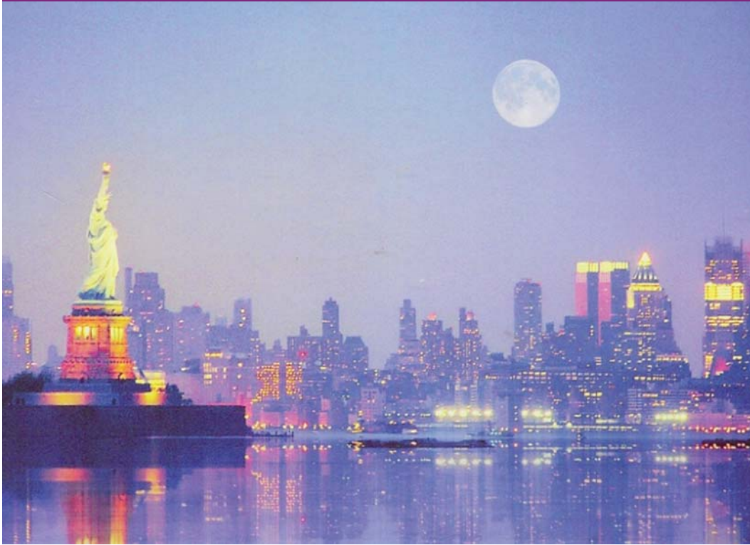
Figure 2.1 Many believe that crime rates go up during the full moon, but scientific research does not support this conclusion.