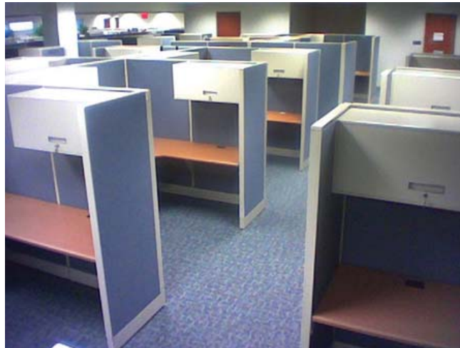
Figure 2.8 Field research happens in real locations. What type of environment do work spaces foster? What would a sociologist discover after blending in?

Nickel and Dimed: On (Not) Getting By in America , the book she wrote upon her return to her real life as a well-paid writer, has been widely read and used in many college classrooms.