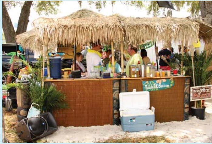
Figure 2.6 Business suits for the day job are replaced by leis and T-shirts for a Jimmy Buffett concert.

Some sociologists study small groups of people who share an identity in one aspect of their lives. Almost everyone belongs to a group of like-minded people who share an interest or hobby. Scientologists, folk dancers, or members of Mensa (an organization for people with exceptionally high IQs) express a specific part of their identity through their affiliation with a group. Those groups are often of great interest to sociologists.