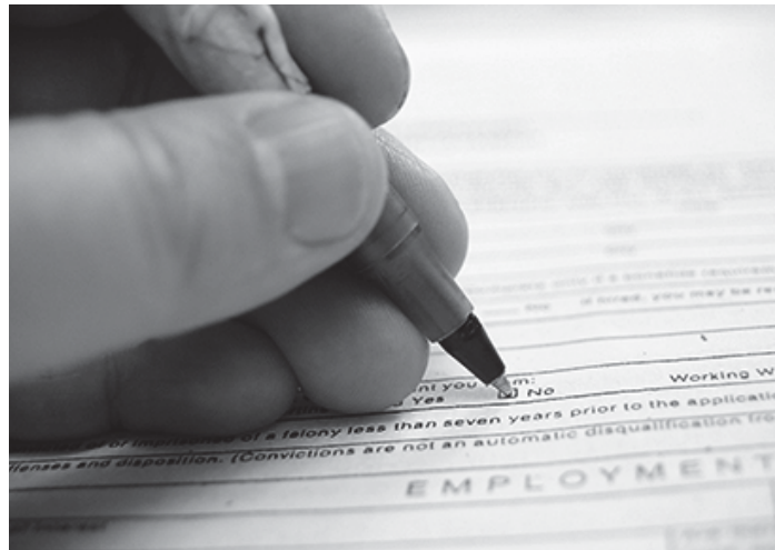
Figure 2.3 Questionnaires are a common research method; the U.S. Census is a well-known example.

As a research method, a survey collects data from subjects who respond to a series of questions about behaviors and opinions, often in the form of a questionnaire. The survey is one of the most widely used scientific research methods. The standard survey format allows individuals a level of anonymity in which they can express personal ideas.