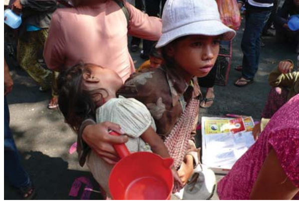
Figure 10.5 How poor is poor for these beggar children in Vietnam?

What does it mean to be poor? Does it mean being a single mother with two kids in New York City, waiting for the next paycheck in order to buy groceries? Does it mean living with almost no furniture in your apartment because your income doesn't allow for extras like beds or chairs? Or does it mean having to live with the distended bellies of the chronically malnourished throughout the peripheral nations of Sub-Saharan Africa and South Asia? Poverty has a thousand faces and a thousand gradations; there is no single definition that pulls together every part of the spectrum. You might feel you are poor if you can't afford cable television or buy your own car. Every time you see a fellow student with a new laptop and smartphone you might feel that you, with your ten-year-old desktop computer, are barely keeping up. However, someone else might look at the clothes you wear and the calories you consume and consider you rich.