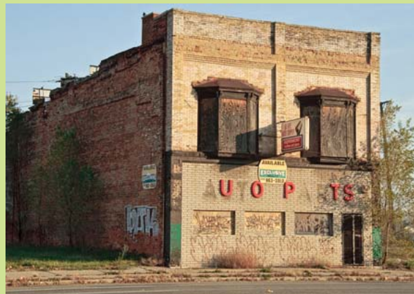
Figure 10.3 This dilapidated auto supply store in Detroit is a victim of auto industry outsourcing.

Capital flight describes jobs and infrastructure moving from one nation to another. Look at the U.S. automobile industry. In the early twentieth century, the cars driven in the United States were made here, employing thousands of workers in Detroit and in the companies that produced everything that made building cars possible. However, once the fuel crisis of the 1970s hit and people in the United States increasingly looked to imported cars with better gas mileage, U.S. auto manufacturing began to decline. During the 2007–2009 recession, the U.S. government bailed out the three main auto companies, underscoring their vulnerability. At the same time, Japanese-owned Toyota and Honda and South Korean Kia maintained stable sales levels.