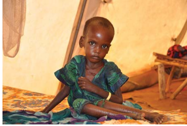
Figure 10.8 For this child at a refugee camp in Ethiopia, poverty and malnutrition are a way of life.

Not surprisingly, the consequences of poverty are often also causes. The poor often experience inadequate healthcare, limited education, and the inaccessibility of birth control. But those born into these conditions are incredibly challenged in their efforts to break out since these consequences of poverty are also causes of poverty, perpetuating a cycle of disadvantage.