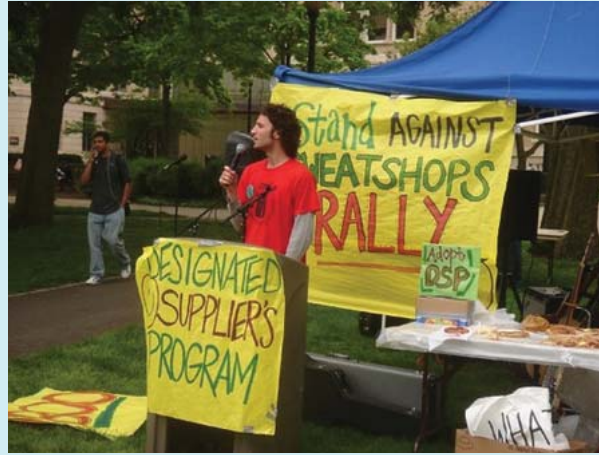
Figure 10.7 This protester seeks to bring attention to the issue of sweatshops.

Most of us don't pay too much attention to where our favorite products are made. And certainly when you're shopping for a college sweatshirt or ball cap to wear to a school football game, you probably don't turn over the label, check who produced the item, and then research whether or not the company has fair labor practices. But for the members of USAS—United Students Against Sweatshops—that's exactly what they do. The organization, which was founded in 1997, has waged countless battles against both apparel makers and other multinational corporations that do not meet what USAS considers fair working conditions and wages (USAS 2009).