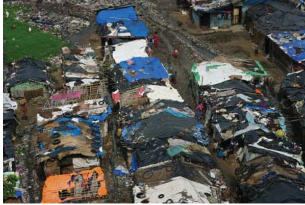
Figure 10.6 Slums in India illustrate absolute poverty all too well.

Subjective poverty describes poverty that is composed of many dimensions; it is subjectively present when your actual income does not meet your expectations and perceptions. With the concept of subjective poverty, the poor themselves have a greater say in recognizing when it is present. In short, subjective poverty has more to do with how a person or a family defines themselves. This means that a family subsisting on a few dollars a day in Nepal might think of themselves as doing well, within their perception of normal. However, a westerner traveling to Nepal might visit the same family and see extreme need.