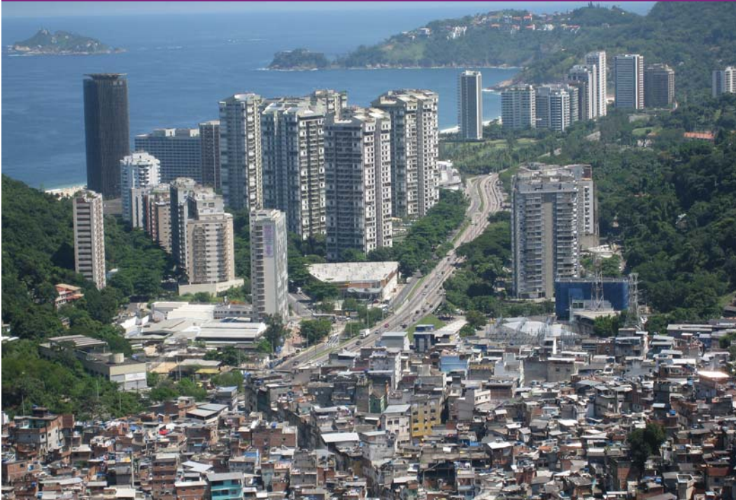
Figure 10.1 Contemporary economic development often follows a similar pattern around the world, best described as a growing gap between the have and have-nots.