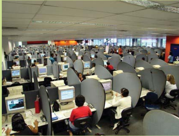
Figure 10.4 Is this international call center the wave of the future?

consumerism that we embrace. A flat screen television that might have cost $1,000 a few years ago is now $350. That cost savings has to come from somewhere. When consumers seek the lowest possible price, shop at big box stores for the biggest discount they can get, and generally ignore other factors in exchange for low cost, they are building the market for outsourcing. And as the demand is built, the market will ensure it is met, even at the expense of the people who wanted it in the first place.